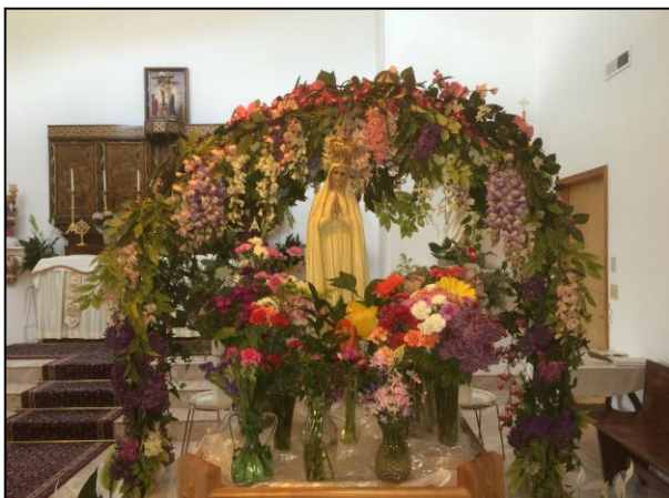
We daily prayed the Rosary before our parish May shrine.

Don't get me wrong, we need school for developing our minds and also so we can be disciplined. But yes, it is a pain. Okay, I'll get back on the subject. Summer is the unattainable idea, until we get there. It motivates. The sun makes the weather warm on this little God-adorned planet we call earth. But summer isn't all cute bunnies and flowers. You get wasps—super annoying buzzing creatures that seem to have barely any purpose in the ecosystem. Eventually too, the heat can get oppressive and burdensome. But if you try to overlook the nasties of the season, which you can, I hope, then this summer will be blessed, happy, prayerful, and the best season of the year. Have a very happy summer!