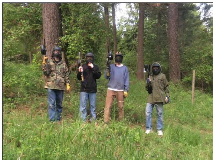
No, not aliens from Outer Space, just seminarians enjoying a game of paintball.