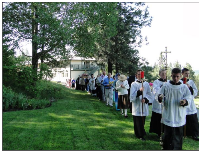
The annual Queenship procession on May 31st wends its way along the grassy path.