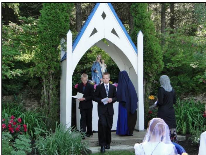
During our procession we paused at Our Lady's shrine, as the parishioners presented their bouquets.