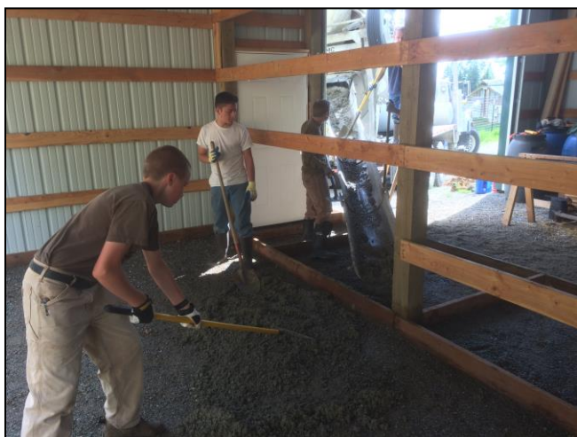
The seminarians helped to smooth a concrete floor in our barn.