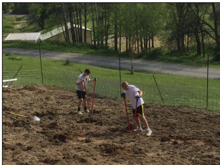
Seminarians help prepare our new vineyard.