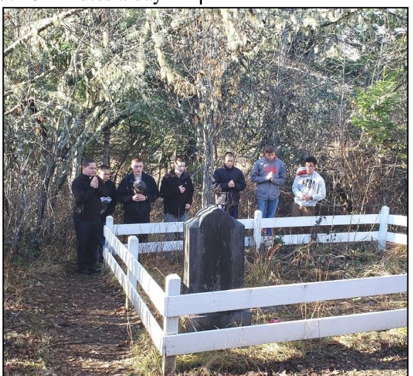
The seminarians stopped by the graveyard at efficient and important in the life of the Cataldo mission to pray for the faithful departed.

Seemed simple enough. However, we spectacularly