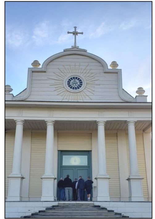
During our Thanksgiving Break we visited the Sacred Heart Mission church, built by the Jesuit Missionaries and the Coeur d'Alene Indians