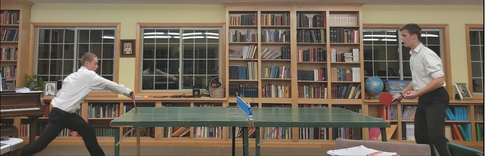
The annual ping-pong tournament included some intense competition.