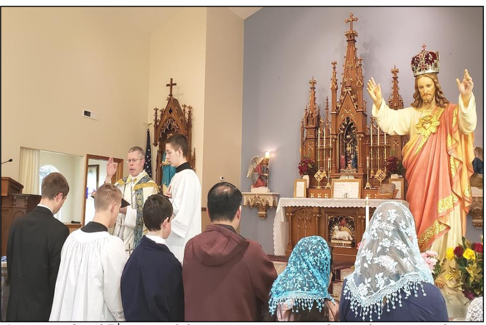
On November 27<sup>th</sup> some of the seminarians joined parishioners in the enrollment in the Miraculous Medal.