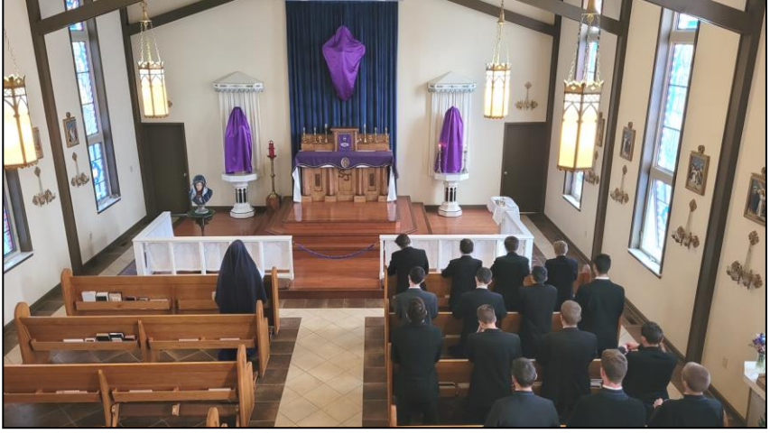
The violet-covered statues provide a stark beauty to our daily prayers during Passiontide.