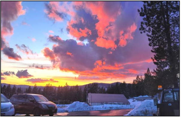
A March sunset reflected the beauty of God's creation with its various colors.