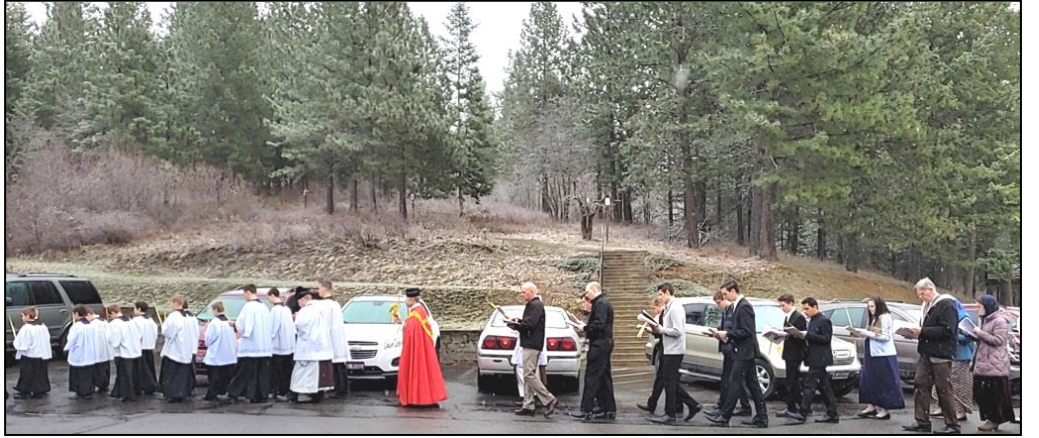
Our Palm Sunday procession had to be shortened this year, due to the

The welcome return of spring is an important reminder to us of the beauty of the spiritual life. It is most