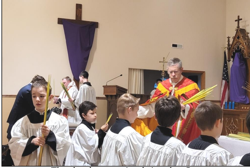
The altar boys receive their palms first before the remaining parishioners.

The doesn't enjoy spring? After the cold and snow of winter, warmer weather and longer days are a