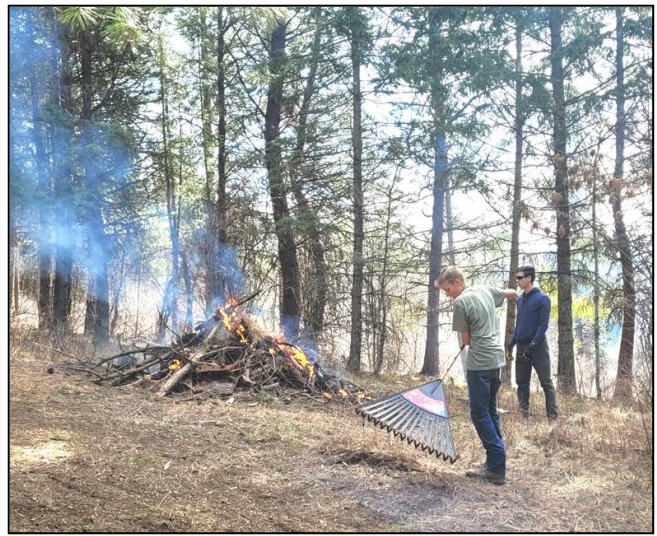
There has been plenty of work to be done on the grounds this spring.