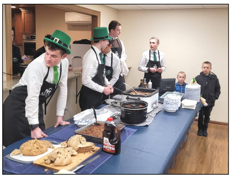
The seminarians dressed the part for the celebration of St. Patrick's Day.