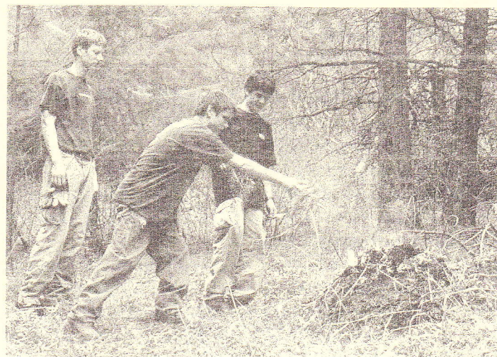
Everyone helps out during a recent work-party at the seminary.