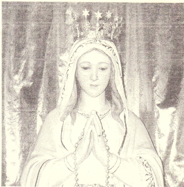
The beautiful statue of Our Lady in our chapel is often visited by the seminarians.