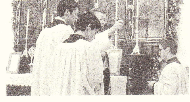
All the seminarians had a part in the liturgy of the blessing of candles on February 2<sup>nd</sup>.

Our Lady. In the past the nuns have found dew on the hem of the statue's robes, from Our Lady's walks in the garden at night. Since Vatican II, however, there haven't been any recent occurrences of this marvel. Although devotion is still strong in Ecuador, it is evident the people have begun to adopt various aspects of the new religion. We had many crosses to bear, and these seemed to start the week before we left. Even so, the pilgrimage was wonderful, and the people were cordial, especially the guides. This pilgrimage was really a wonderful and spiritually uplifting experience.