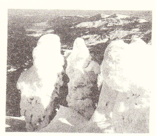
The trees at the top of Mt. Spokane, shrouded in snow, look like ghostly sentinels.