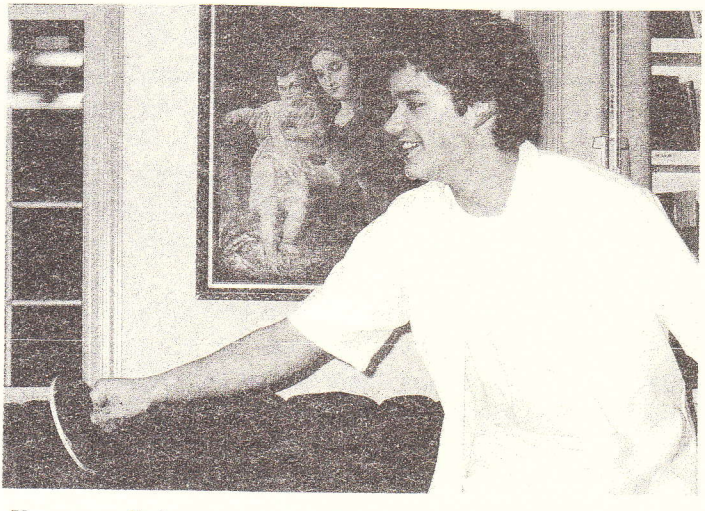
You can tell the games are getting intense when the players have to unbutton their shirts, due to sweating!