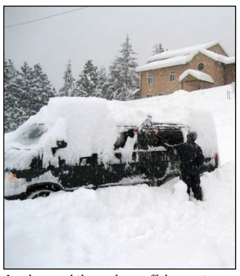
It takes a while to clean off the seminary van after a big snow storm.