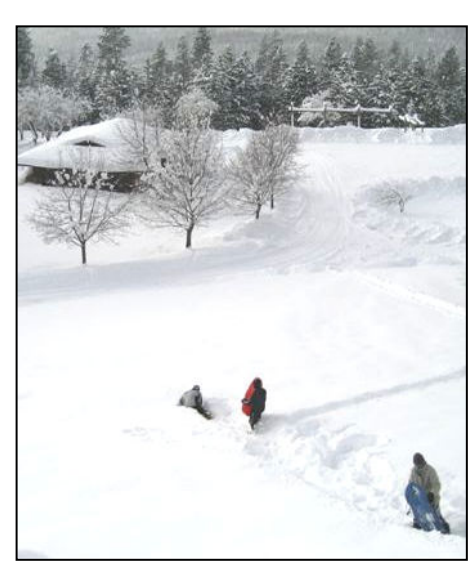
Our first good snow provided plenty of opportunity for sledding on the hill next to the seminary.