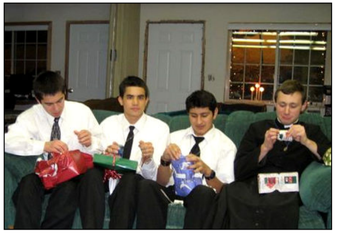
Everyone enjoyed the opening of gifts.