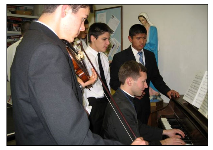
Everyone enjoys the opportunity for a sing-along around the piano.