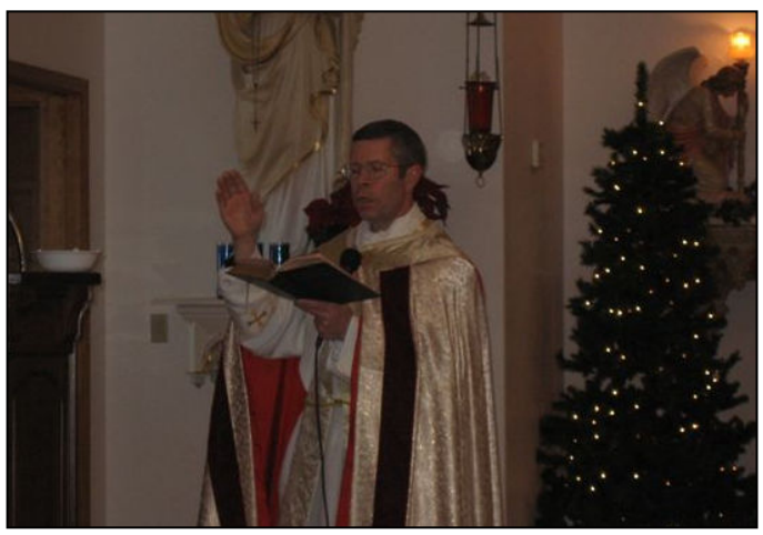
We observe the traditional blessing of chalk on the feast of the Epiphany.