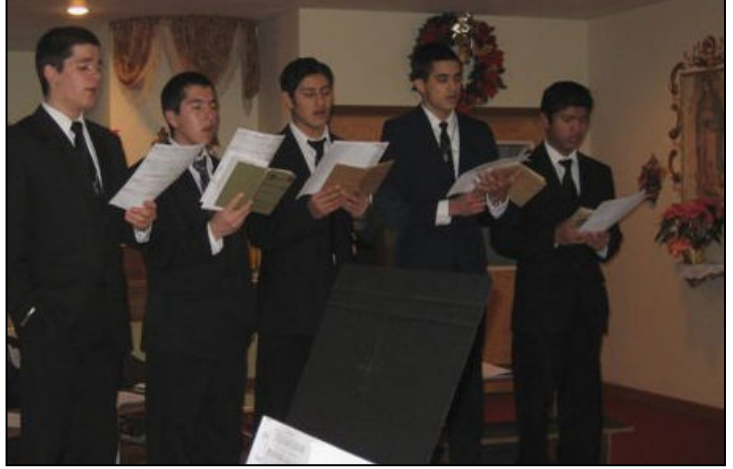
The seminarians sang a High Mass on the feast of the Epiphany.

On Tuesdays and Thursdays the same procession is made, but what is better is that on those nights one of the priests hears confessions. How consoling it is to lie in bed, after confession with a clean conscience, and the knowledge that Jesus has forgiven your sins!