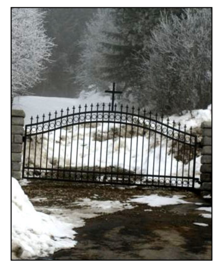
We have a new gate to mark the entrance to our cemetery.