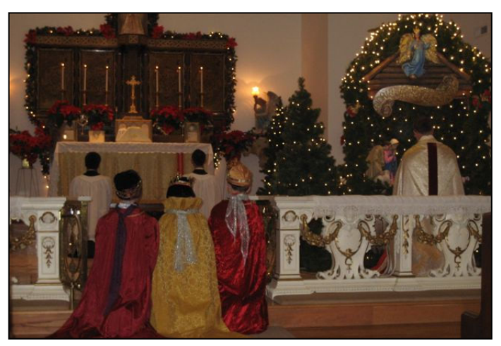
Part of our Epiphany ceremonies is the presentation of gifts by three boys dressed to represent the Three Magi.