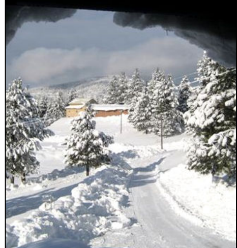
The snow-covered grounds around the seminary are magnificent in winter.