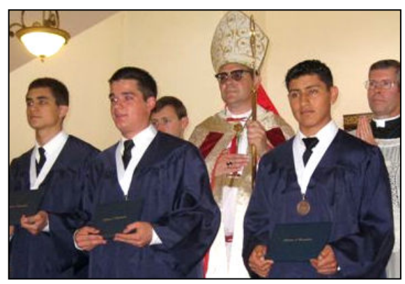
The bishop and priests joined the graduates for a group photo after Mass.