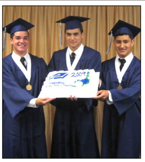
The cake tasted as good as it looks!