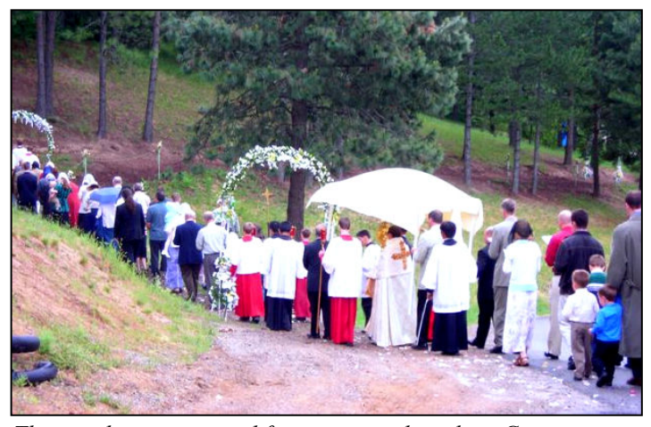
The weather cooperated for our annual outdoor Corpus Christi procession.