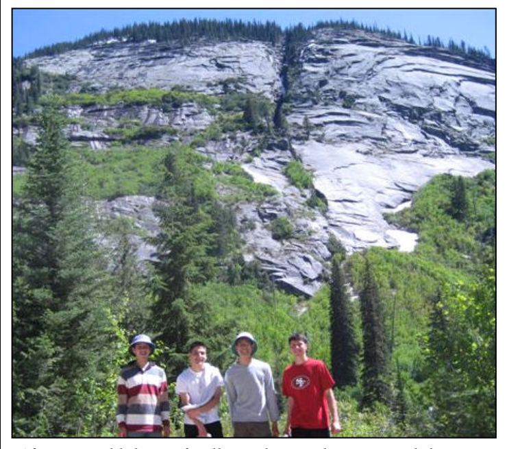
After a good hike we finally made it to the granite slides.

If you are a young man of high school age who has a vocation, then St. Joseph Seminary may be the place for you. Our four-year course of studies offers the regular high school curriculum, with an emphasis on Theology, Latin, choir and foreign language. A well-rounded program of daily Mass, prayer and sports complements our academic schedule. For more information, write to the rector of St. Joseph Seminary at the address below.