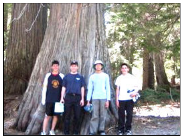
The trees around Priest Lake are magnificent works of the Creator.