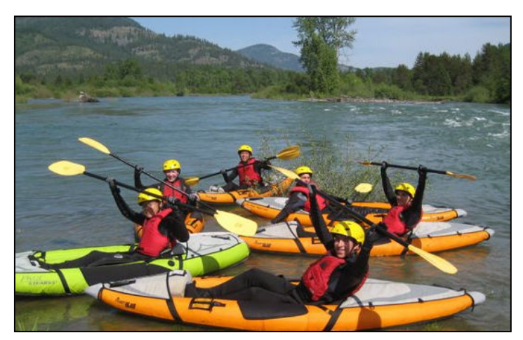
Seminarians prepare to kayak down Priest River.