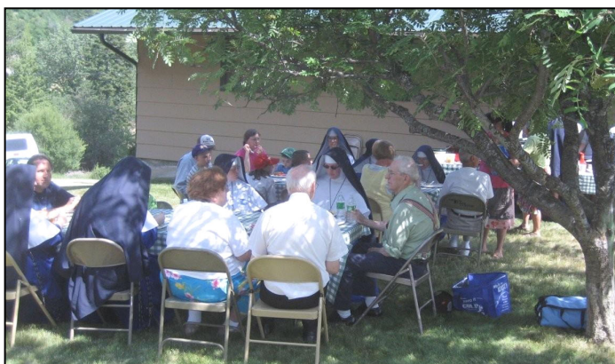
Our annual parish picnic brings the parishioners together for an enjoyable afternoon.