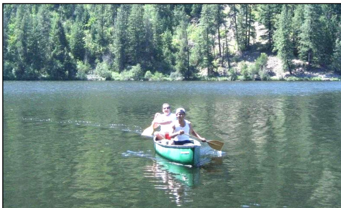
Canoeing down the Coeur d'Alene River is one of our favorite activities.