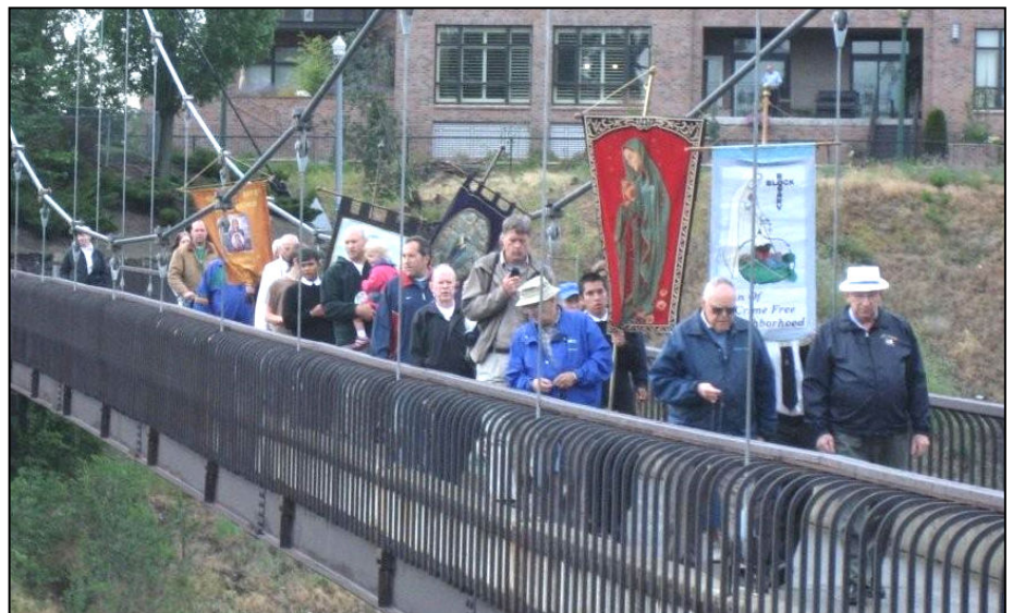
The seminarians joined in on the public Rosary in Spokane on July 13 th .