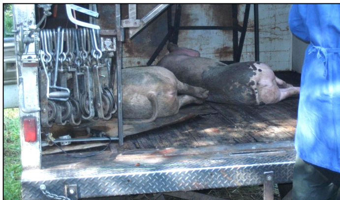
The slaughtered pigs have been sent to the butcher to be cut and packaged for our freezer.