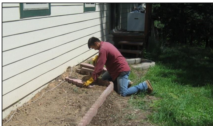
One of the seminarians prepares a flower bed at the seminary.