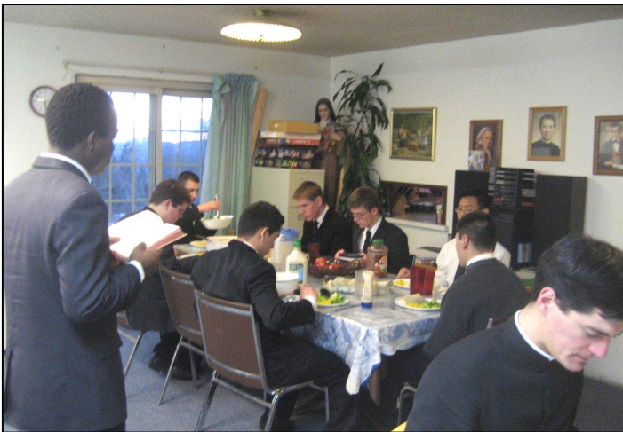
During the annual retreat we have table reading at all the meals.