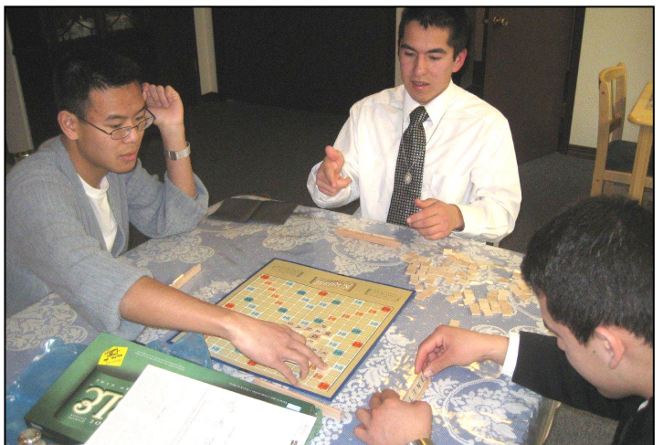
The seminarians play a game of Scrabble — in Spanish.