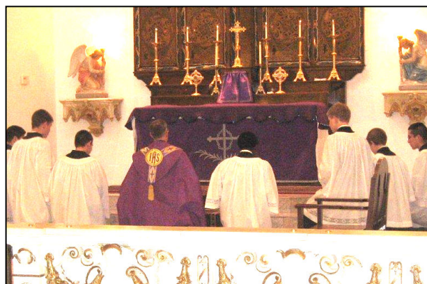
During Lent we chant Vespers every Sunday.