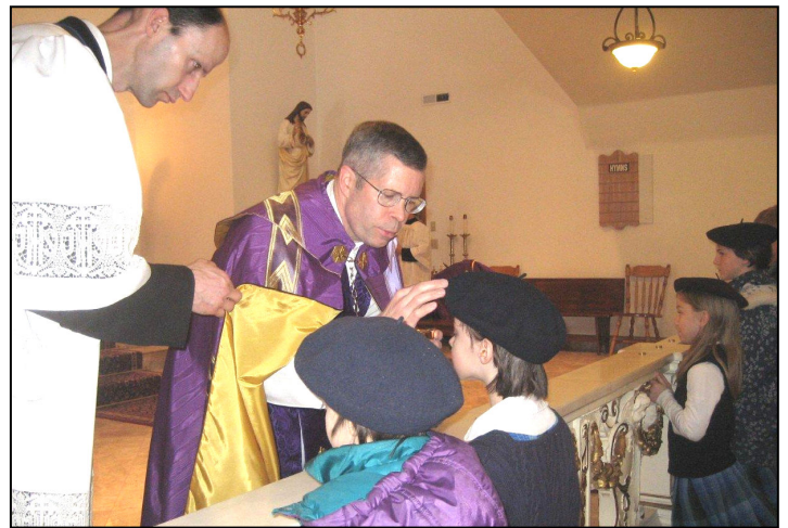
The receiving of blessed ashes at the beginning of Lent is a solemn reminder of our need to do penance.