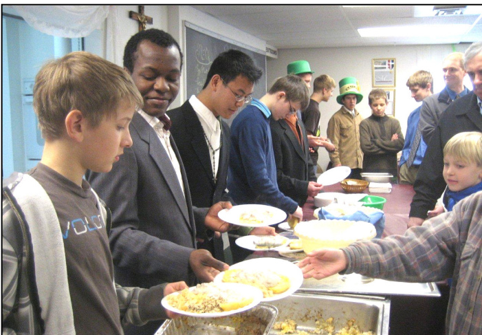
The seminarians prepared and served a breakfast to parishioners during March in honor of St. Joseph and St. Patrick.