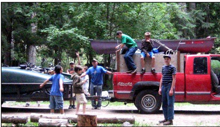
Preparing to set up camp along the St. Joe River.