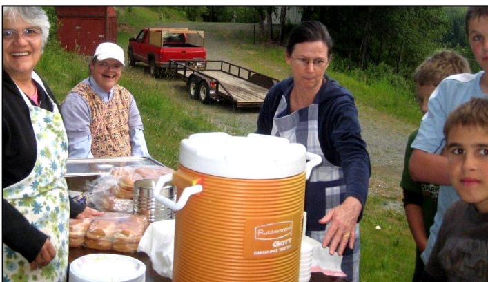
Lots of activities makes for big appetites . . . our three dedicated cooks helped to make the summer camp a great success.