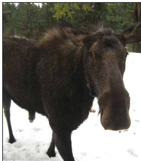
This curious moose came right up to the seminary door!