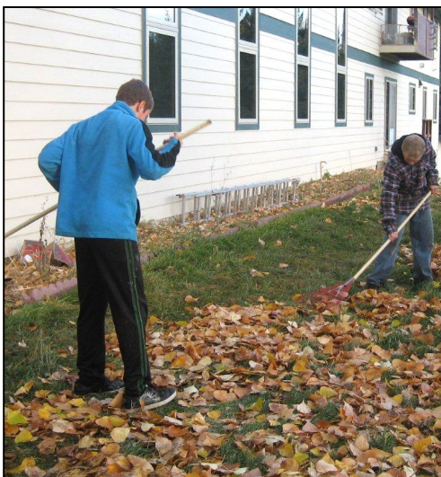
Raking leaves was just one of our fall chores.