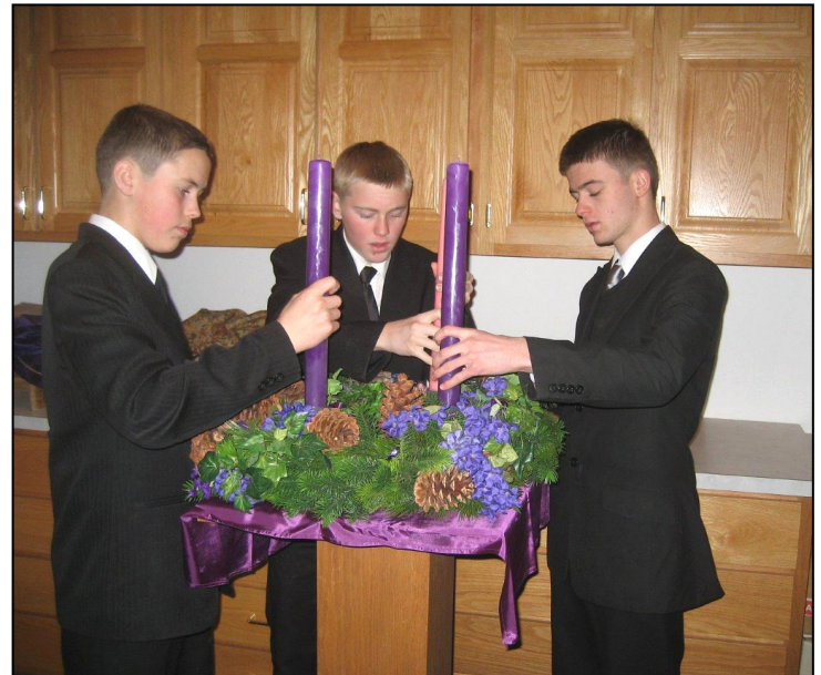
The Advent wreath is one of our favorite customs this time of year.