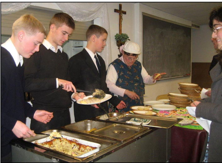
A breakfast fundraiser for the seminary.