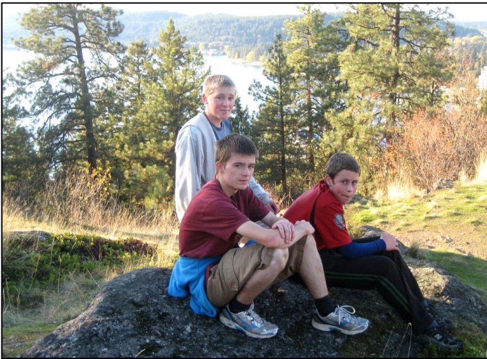
Seminarians on a fall outing by Lake Coeur d'Alene.