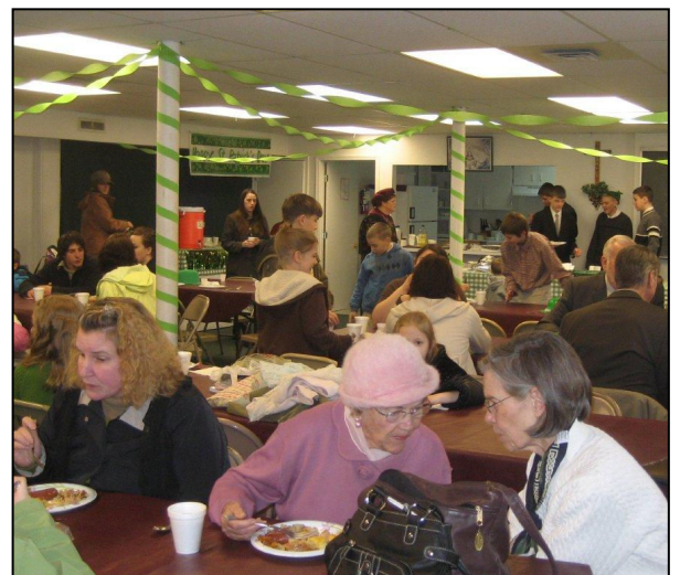
Our Laetare Sunday breakfast was well-attended.