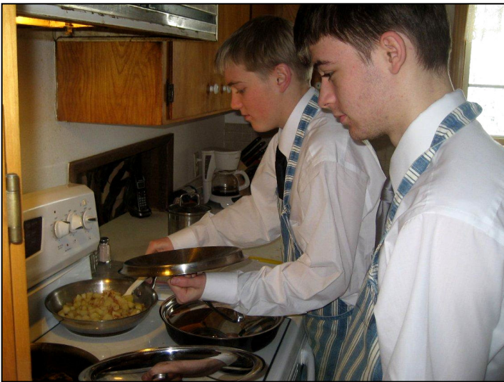
On Sundays we cook our own breakfast, giving our cooks a break from their daily chores.