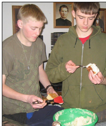
We spend a lot of time making "blarney stones" for the parish breakfast.