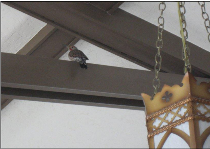
The woodpecker perched on the beams in front of the tabernacle for a couple hours.