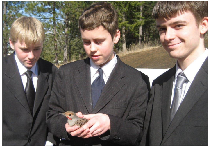
The seminarians prepare to release the bird back into the wild.