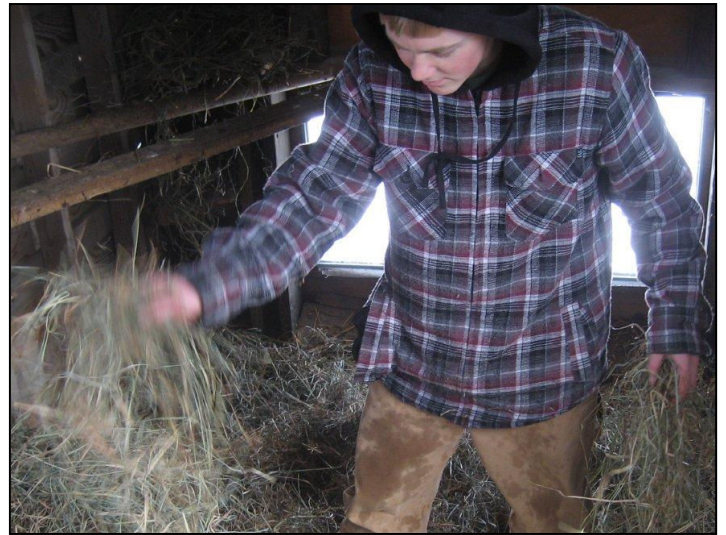
The seminarians recently cleaned out the chicken coop and goat pen and spread new straw.