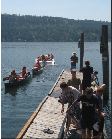
The camp included a lot of water activities on the river and on Lake Coeur d'Alene.