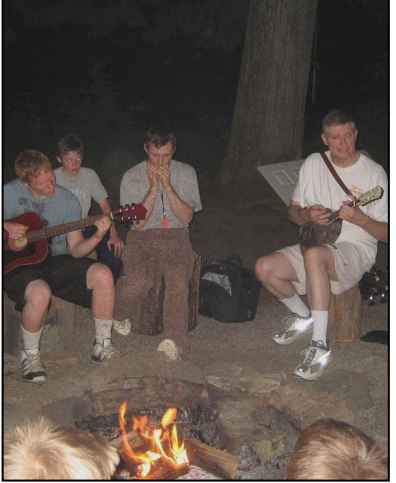
Evenings included music around the campfire.

(left) A group photo on the mountaintop, after raising the cross made from beams which were carried up the mountain by the boys.