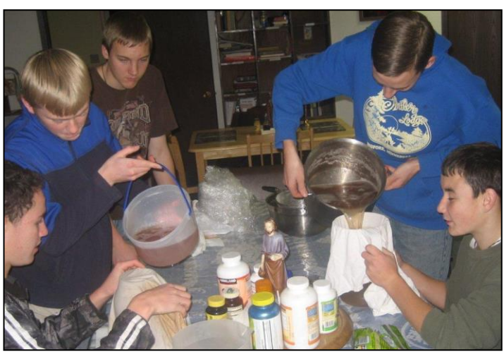
After the pressing, the cider is filtered.