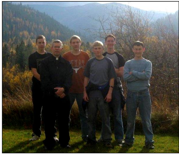
On the feast of All Saints we stopped by the Cataldo mission during a seminary outing.

I will end this article by saying that the Cristeros are good examples to us, never to abandon our Catholic Faith.