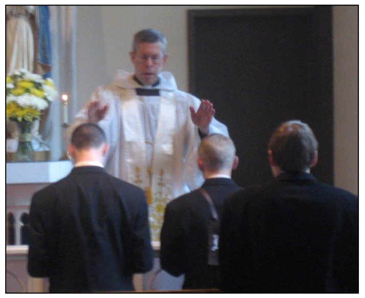
New sodality members were received on Our Lady's feastday of the Presentation.

Keepers of mortal men unseen, In airy vesture dight, Their good and evil deeds they scan, Stern champions of the right.