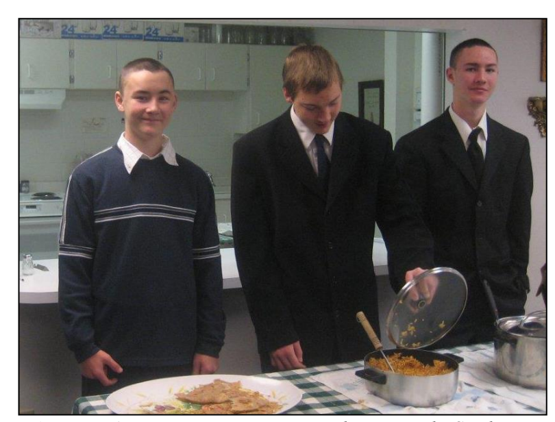
After a good preparation, we're now ready to serve the Sunday parish breakfast.