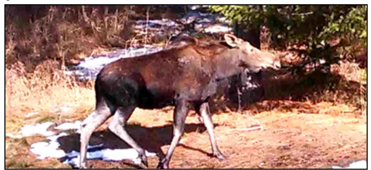
This moose has been seen foraging near the seminary.