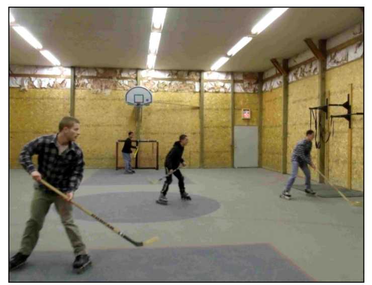
The seminarians enjoy playing hockey in the gym.