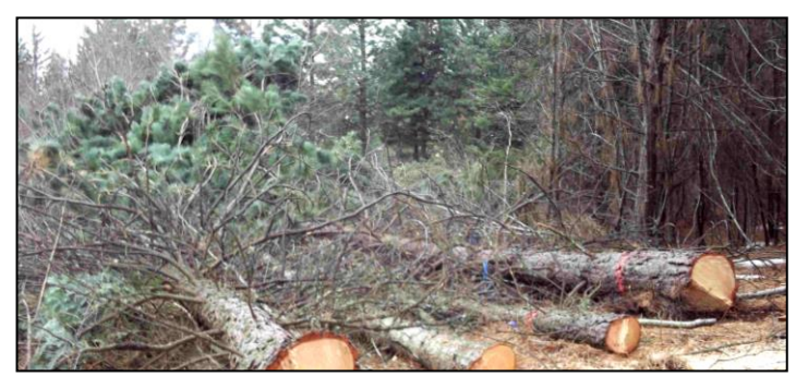
A recent project — cutting down pine trees by the cemetery to improve the view. Pa