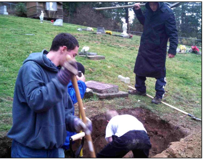
The seminarians assist in digging the grave for a deceased parishioner.