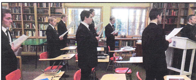
Before class we recite a prayer and sing a hymn.