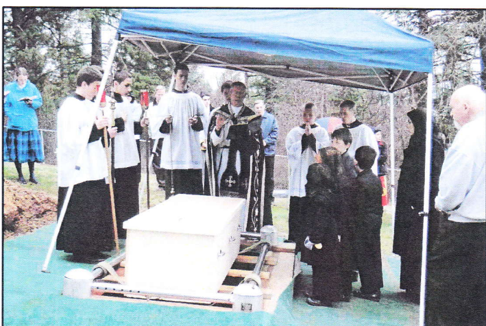
The weather was mild on December 12 for the graveside ceremonies.