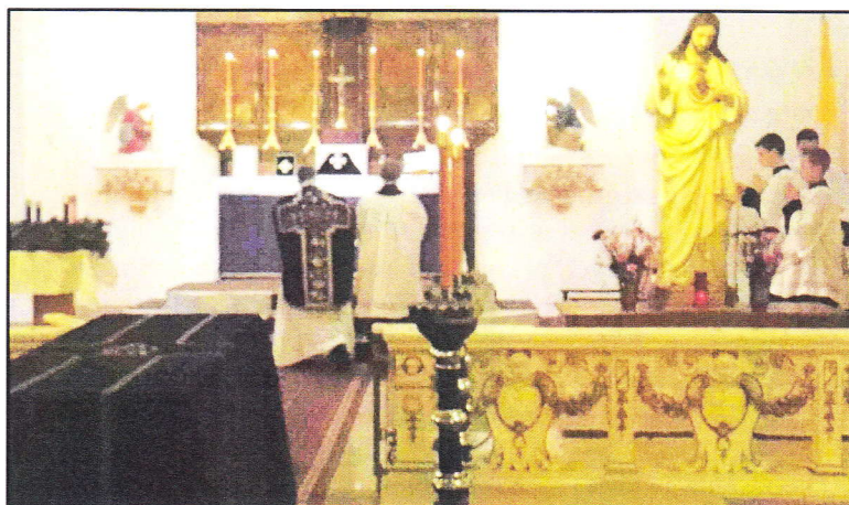
All the seminarians were involved in serving the funeral Mass.