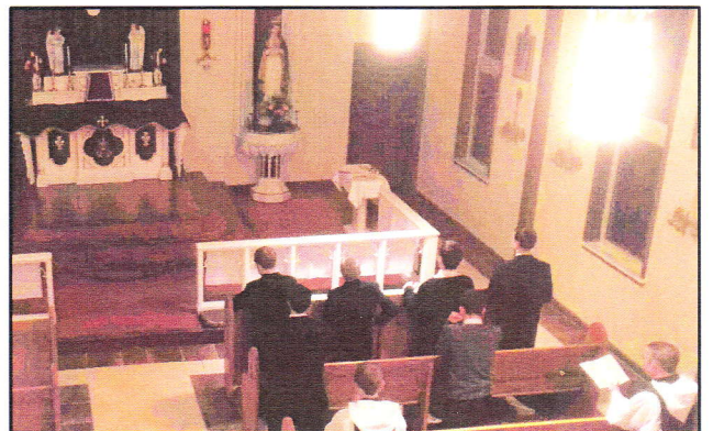
Night prayers at the seminary, as seen from the choir loft.