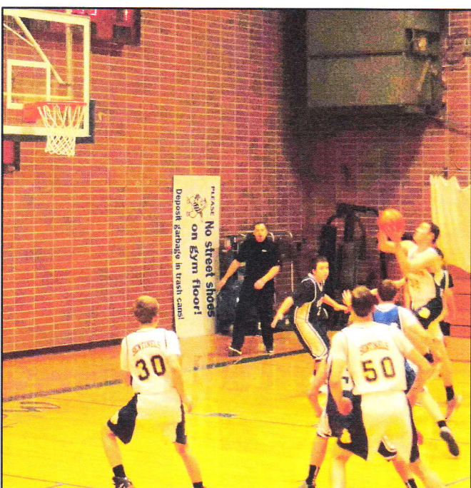
Some of the basketball action in one of our games.