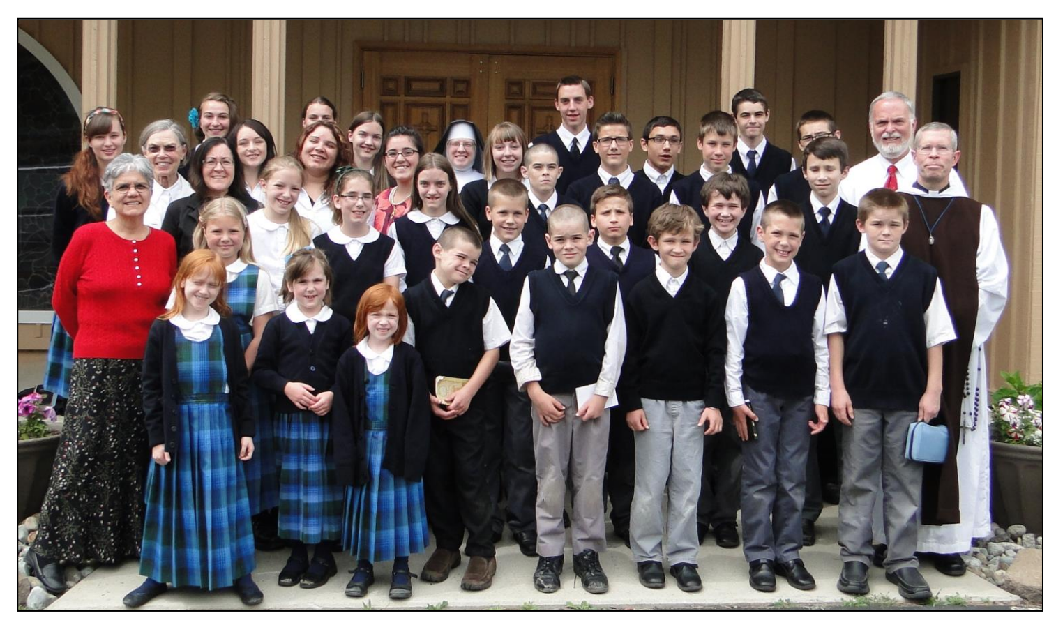
The students and teachers of our parish school.