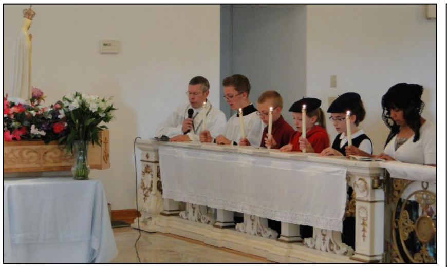
Seminarians and students who have made the 33-day preparation make the act of Total Consecration to Jesus through Mary on the feast of Our Lady's Queenship.