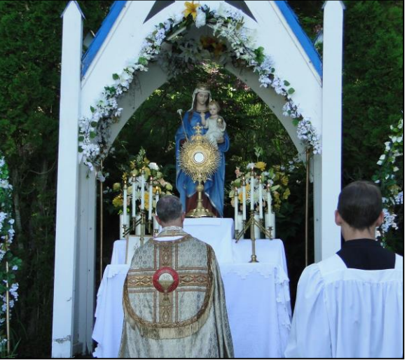
During the Corpus Christi procession, we paused for benediction at each of the outdoor altars.