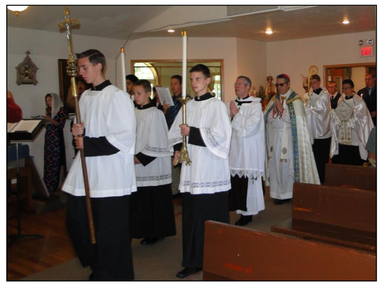
The opening procession with His Excellency at the graduation ceremony.