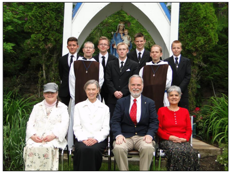
Our staff and students posed for a group picture during the final days of the school.