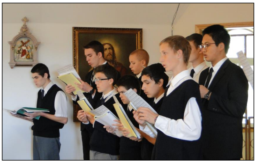
Some of the boys from our parish school joined the seminarians in singing a High Mass for the Feast of St. Michael.