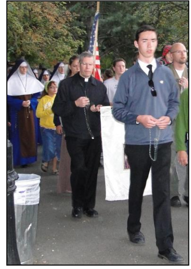
We attended the Fatima rosary procession in downtown Spokane.