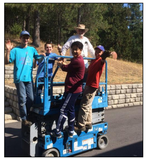
Smile and say "stinky" cheese.