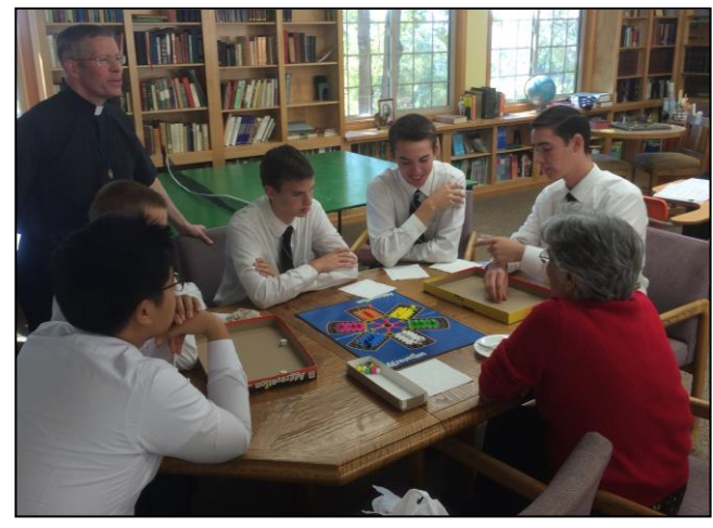
Just a little friendly game of aggravation.