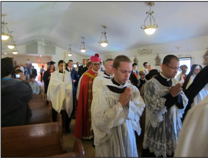
His Excellency came to distribute the diplomas at our commencement ceremonies on June 3.