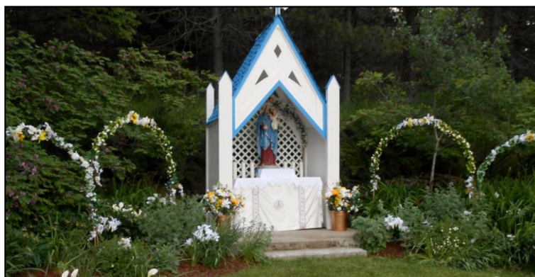
A view of the outdoor shrine of Our Lady, prepared for the Blessed Sacrament.