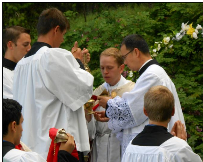
Father prepares to incense the Blessed Sacrament at an outdoor altar.