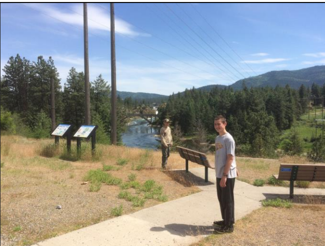
A scenic view in northern Idaho.