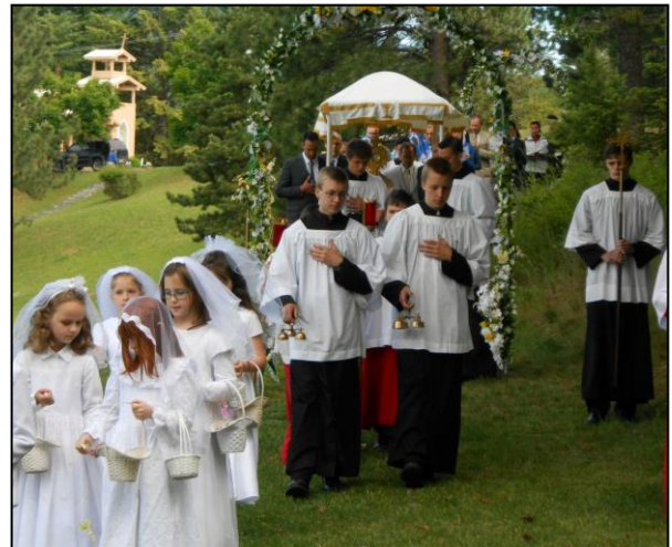
Children dressed in white and servers precede the canopy with the Blessed Sacrament.