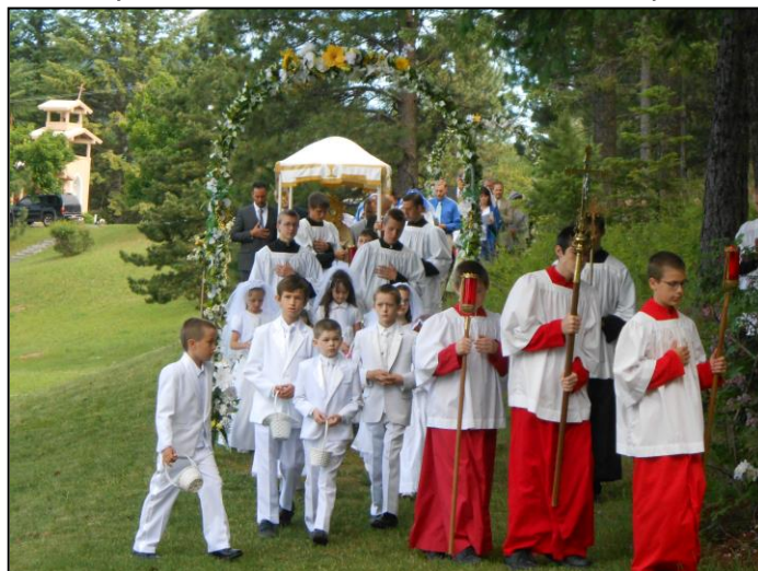
The Corpus Christi procession approaches one of the outdoor altars.