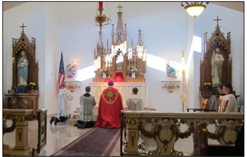
Our graduation ceremony begins with the invocation to the Holy Ghost.