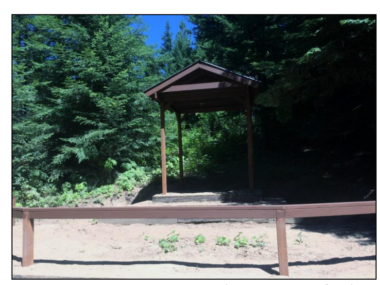
This outdoor shelter was built at the Boys' Camp for the celebration of Holy Mass.