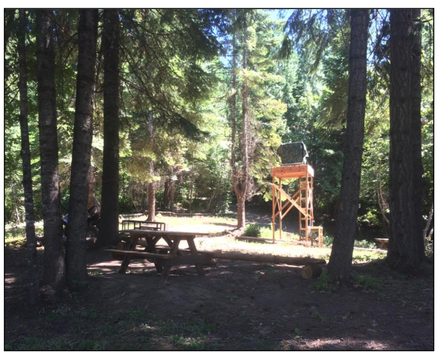
Many hours of labor have been expended in preparing the site for the Boys' Camp.