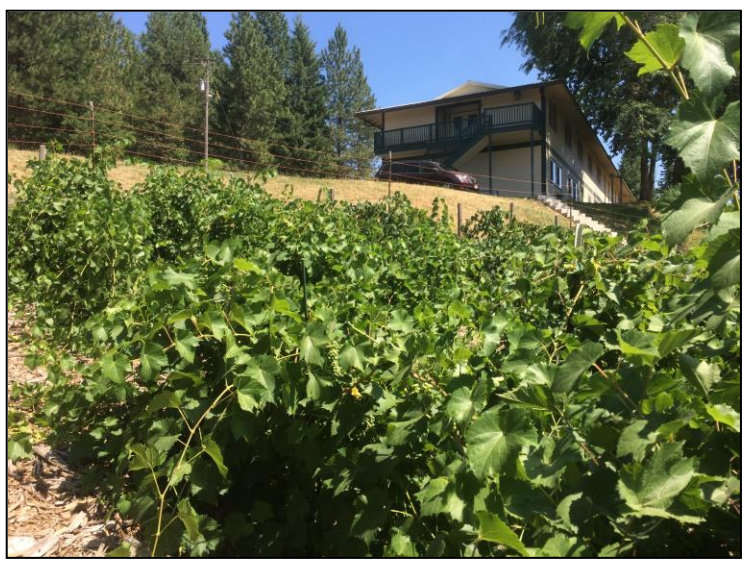
Our seminary vineyard was planted just 2 years ago but is now burgeoning with grapes.