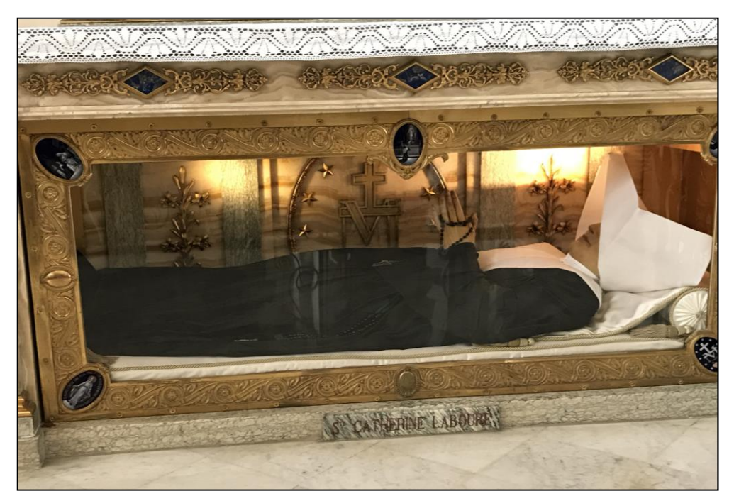
The incorrupt body of Saint Catherine Laboure rests in the chapel where Our Lady revealed to her the design for the Miraculous Medal.