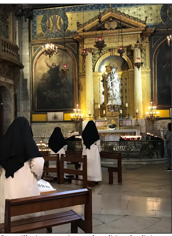
One still witnesses piety and traditional religious habits at the shrine of Our Lady of Victories in Paris.