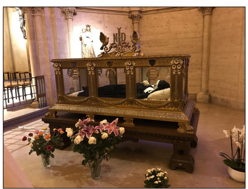
The incorrupt body of Saint Bernadette reposes peacefully in Nevers, France.