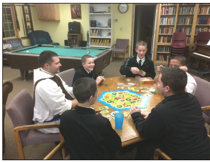
The seminarians enjoy board games for recreation.