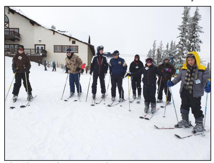
The Skiing Adventure is About to Begin!