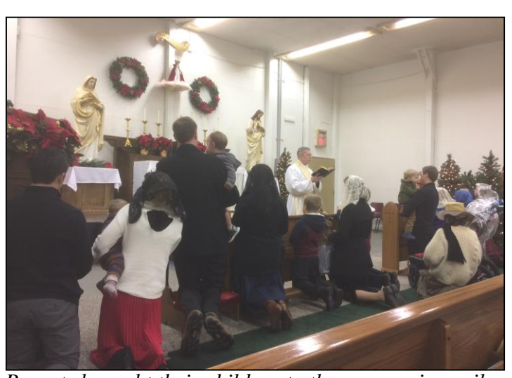
Parents brought their children to the communion rail for the annual blessing of children during the Christmas