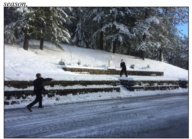
The seminarians can't resist the temptation to throw a few snowballs in between classes.