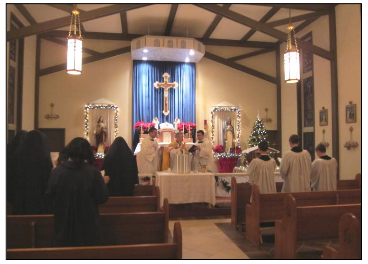
The blessing of Epiphany Water takes place each year on January 5.