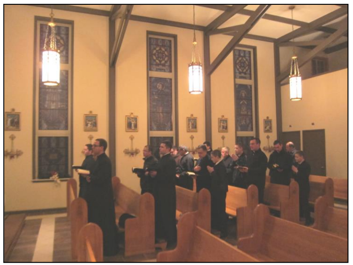
The seminarians joined the priests for Vespers from the Divine Office.