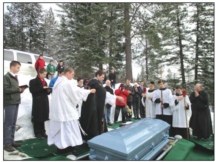
The first of two recent burials at our cemetery took place at the end of February.