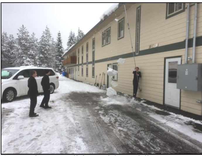
Getting the snow off the roof, lest it fall on an unsuspecting pedestrian.