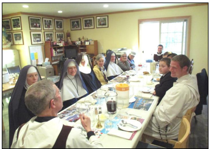
Our Sisters and staff members joined us for dinner on the feast of Saint Joseph.