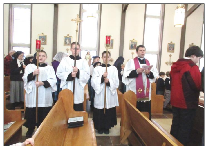
The Stations of the Cross are prayed every Friday at the seminary.