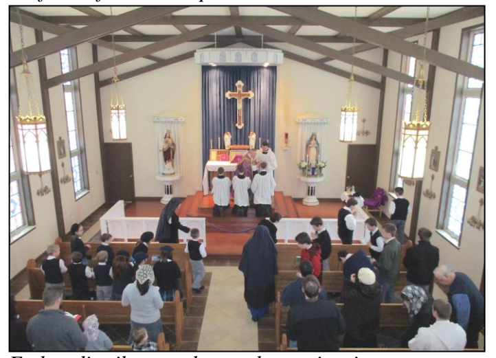
Father distributes ashes to the seminarians.