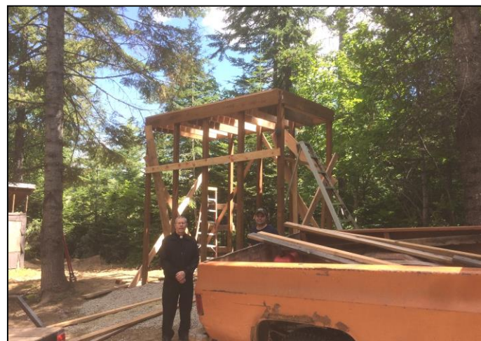
This photo was taken at the site of the camp, as preparations were ongoing.