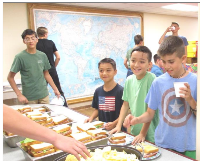
There are lots of hungry boys to be fed at the Boys' Camp.