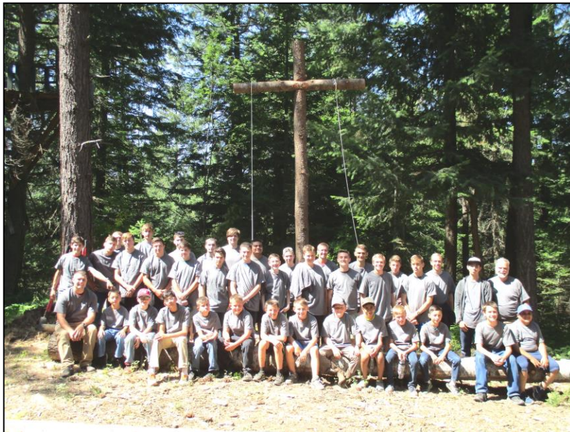
A group photo after the cross has been erected.