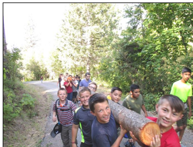
These logs are heavier than you think!