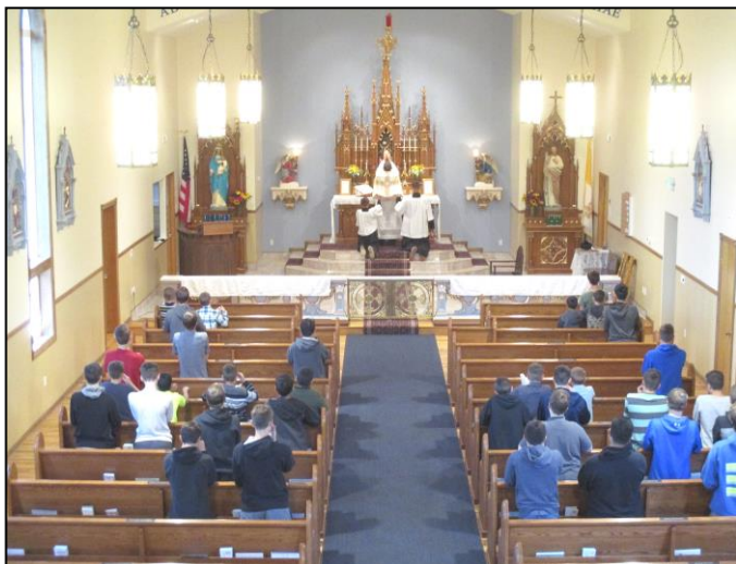
Daily Mass is an essential part of a successful Boy's Camp.