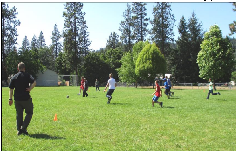
Recreation at the park on the first day of the camp.

O my God, who hast appointed Thine only begotten Son to be the eternal High Priest for the glory of Thy Majesty and the salvation of mankind; grant that they whom He hath chosen to be His ministers and the stewards of His mysteries, may be found faithful in the fulfilment of the ministry which they have received. Through the same Christ our Lord. Amen. (indulgence of 3 years).