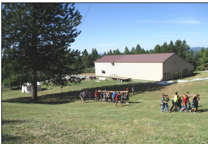
Here the boys begin the task of carrying the two beams for the outdoor cross.