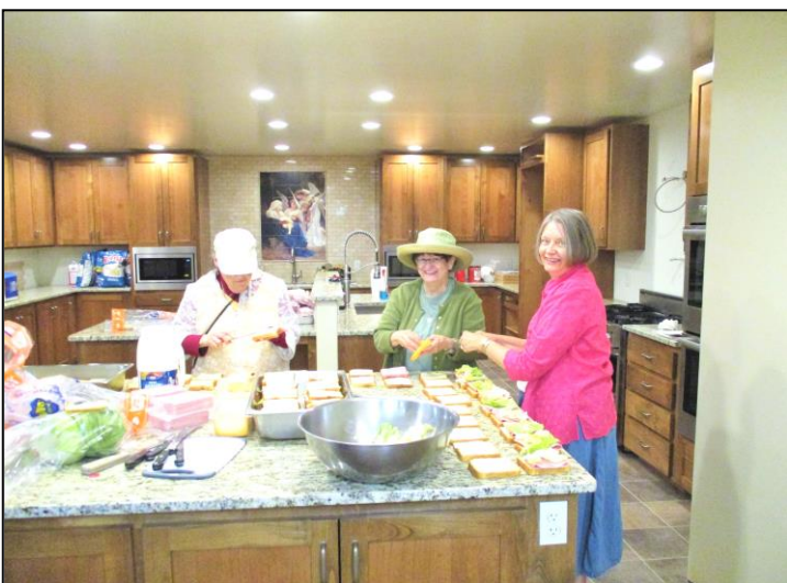
The cooks have been busy preparing meals in the newly remodeled parish hall kitchen.