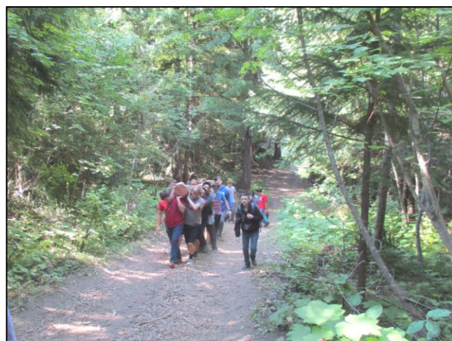
We pray the Stations as the beams are carried up the hill.