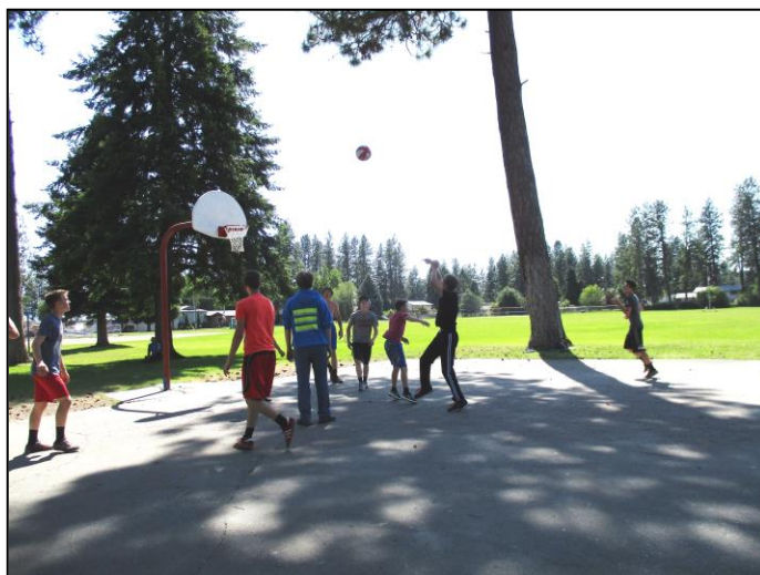
The older boys preferred to play basketball.