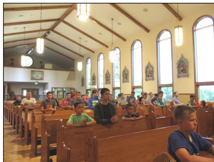
Morning prayers and Mass are held in the church at the Boys' Camp.