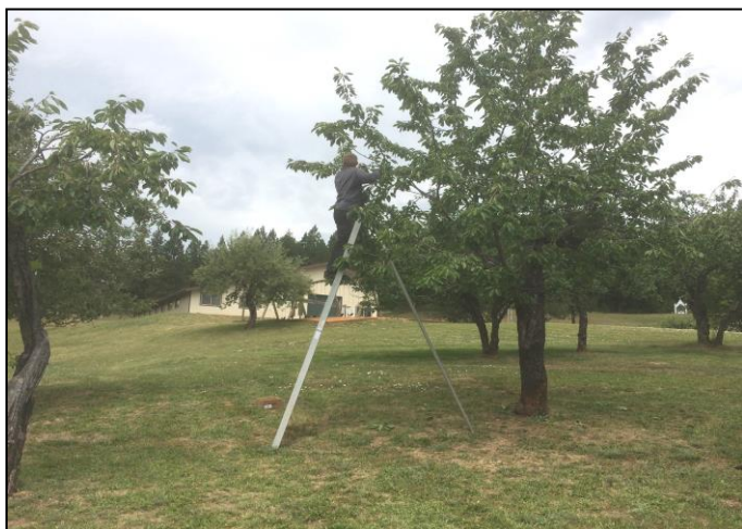
Frater Aloysius harvests the cherries from one of our trees.