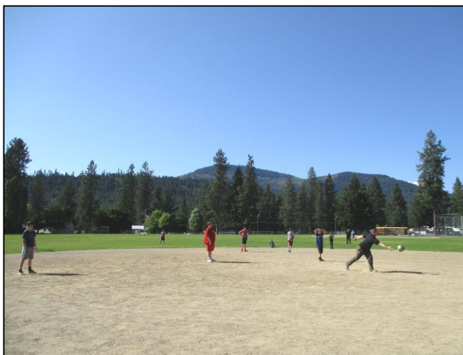
Kickball is always a popular sport.