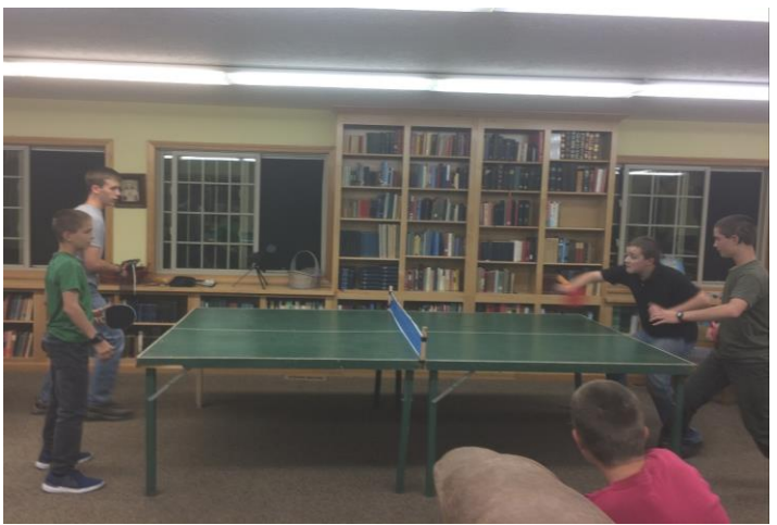
It didn't take long for the seminarians to start using the ping-pong table.