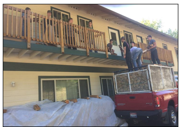
Getting ready for winter—the seminarians stack firewood for the Sisters on the deck outside the convent.