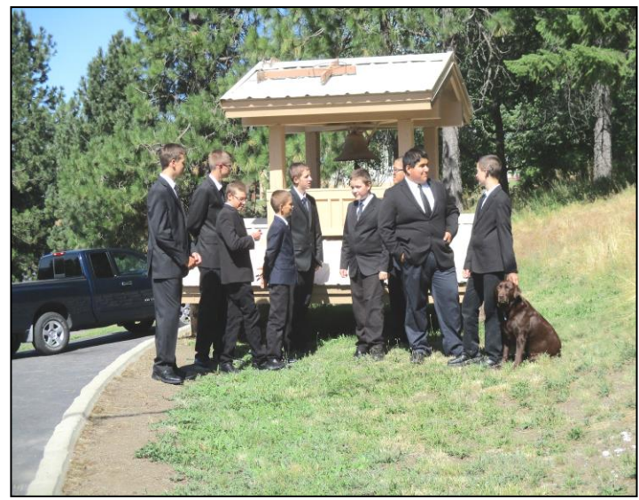
This year's group of boys have had no problem in becoming friends.