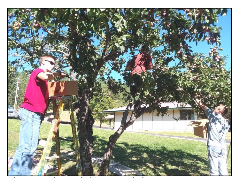
There are plenty of plums to pick this year.