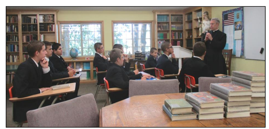
The students take in a class on the first day of school.