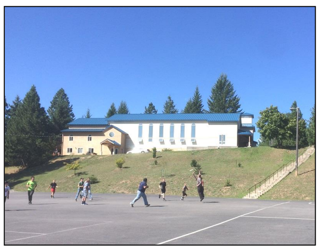
Ultimate Frisbee is a popular recreation after classes.