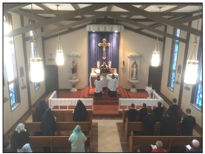
Every day starts off with Holy Mass in our seminary chapel.