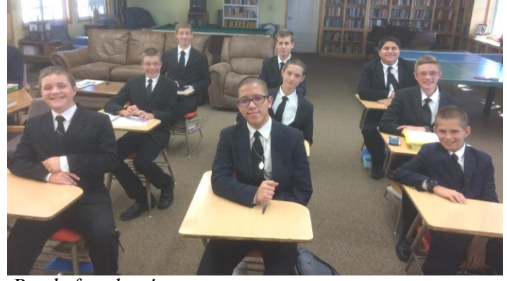
Ready for class!

It is rigorous here to be sure (although probably not as rigorous as the major seminary), but it is a good way to find out if you have a calling to the priesthood, and besides,