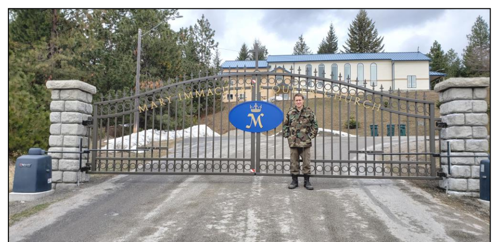
Our new front gate will keep unwanted vehicles from driving into our parking lot at night.