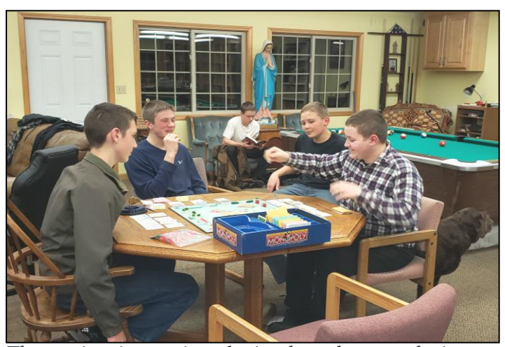
The seminarians enjoy playing board games during their free time.