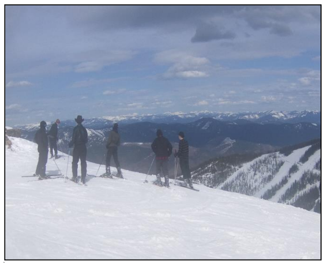
A group of seminarians pauses before another run down the slope.