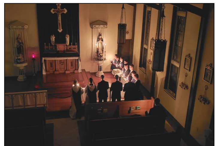
Night prayers conclude with the candlelight procession to Our Lady's shrine.