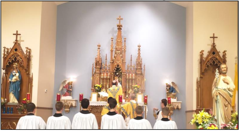
We honored Saint Joseph with a Solemn High Mass on his feastday.

The cow is a Jersey breed and her young bull calf is crossed with Black Angus. We have named the cow Matilda because that was the feast on the day we bought