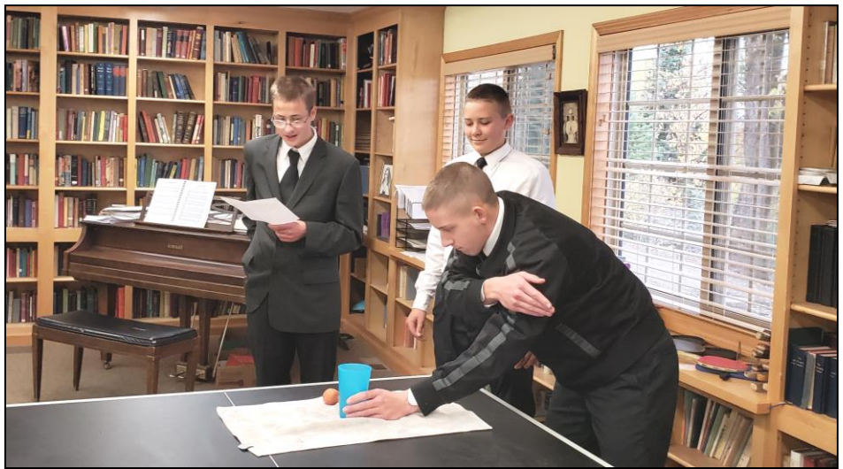
Everyone enjoys the experiments that are conducted during Physics class.