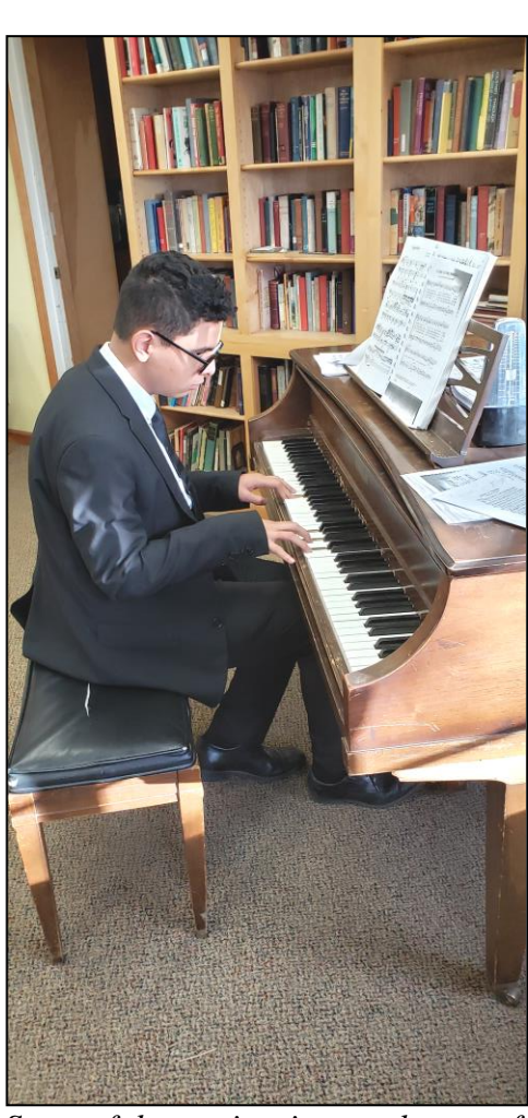
Some of the seminarians make use of our piano during free time.