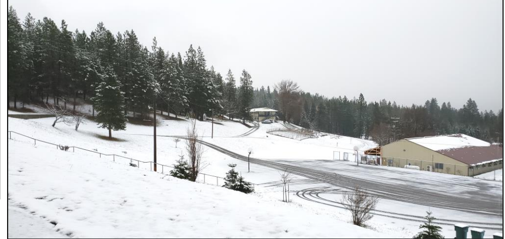
We have only had a few inches of snow thus far—no doubt there will be plenty more as winter settles in.