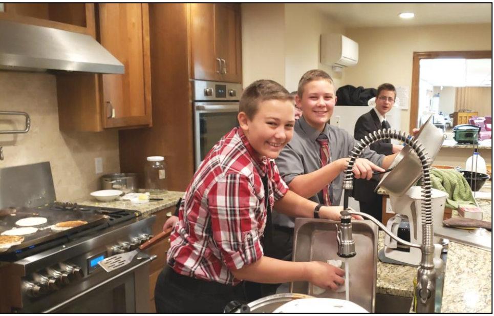
The seminarians held a fund-raising breakfast in November.