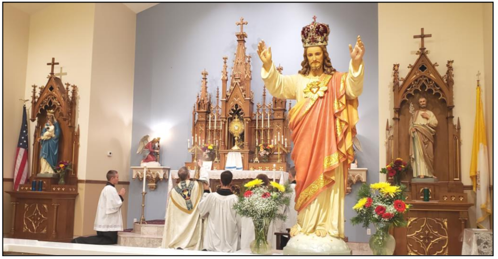
The statue of the Sacred Heart was placed in front of the church for the feast of Christ the King.

Advent contains its own unique scriptural passages and lovely melodies which embody the spirit of the season. Sadly, however, the world—and even many Catholics who