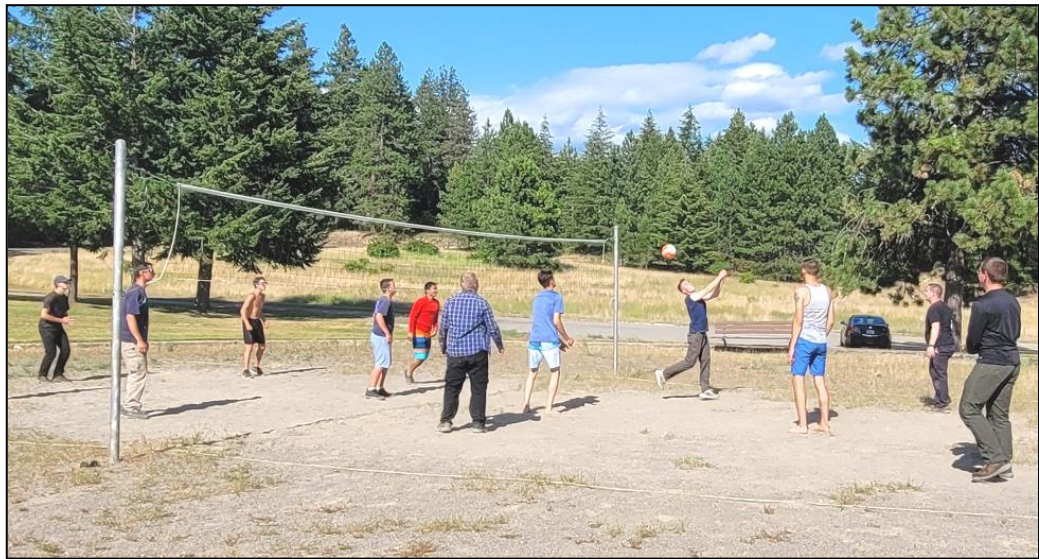
The volleyball net came in handy at the park.