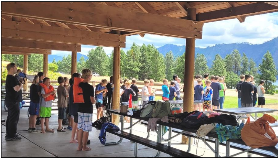
Father leads the Angelus with the boys at Farragut State Park.