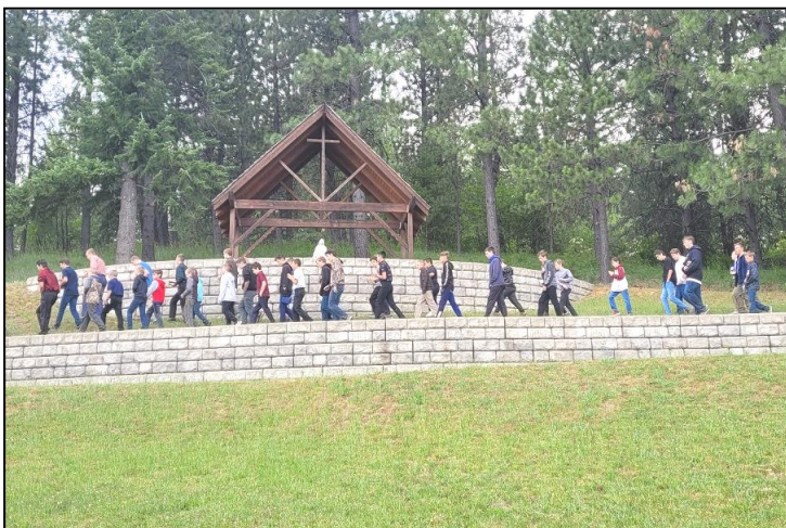
The campers pass in front of the Sacred Heart shrine as they recite the Rosary in procession.