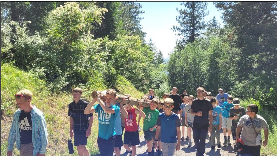
As has been our custom, the Boys Camp began with the Stations of the Cross, while a group of boys carried the two beams of the cross to the camp site.