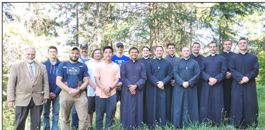
The priests, seminarians and other counselors pause to take a group photo.

expect about a dozen boys. Their presence at the seminary, however, will be augmented by the residence of several religious seminarians from our major seminary, so that will be quite a change.