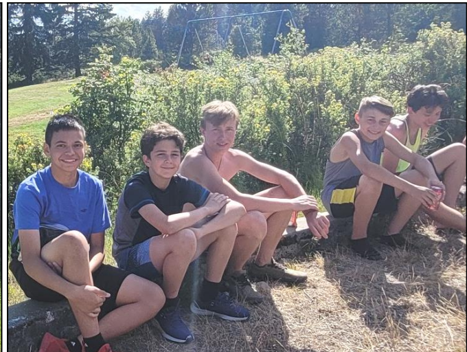
Taking a break between games at the park.