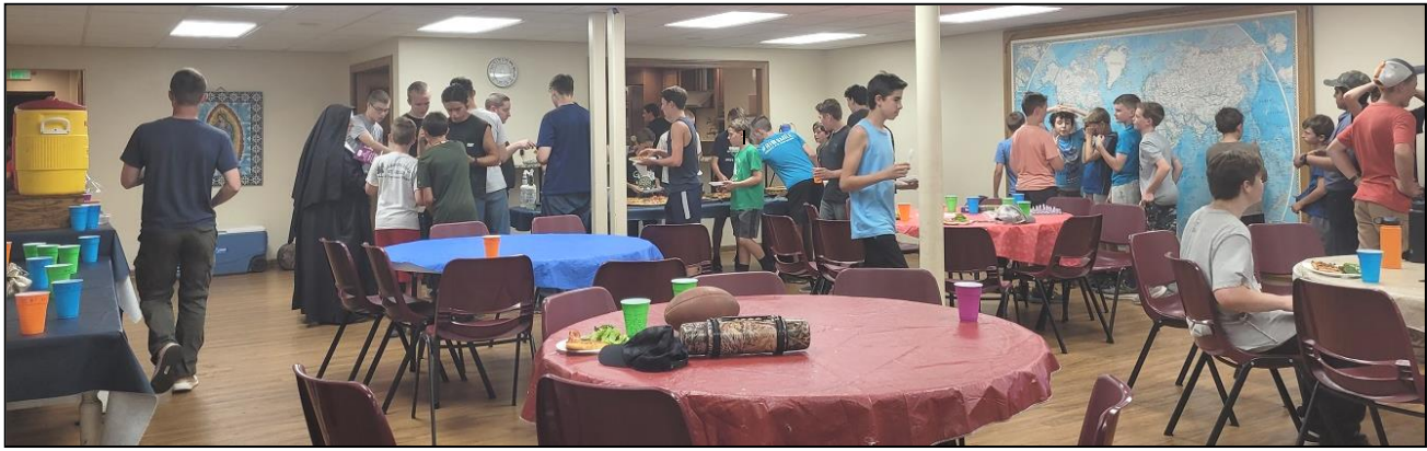
Everyone gathered in the parish hall for meals.