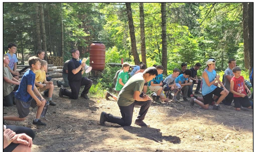
We adore Thee, O Christ, and we praise Thee!