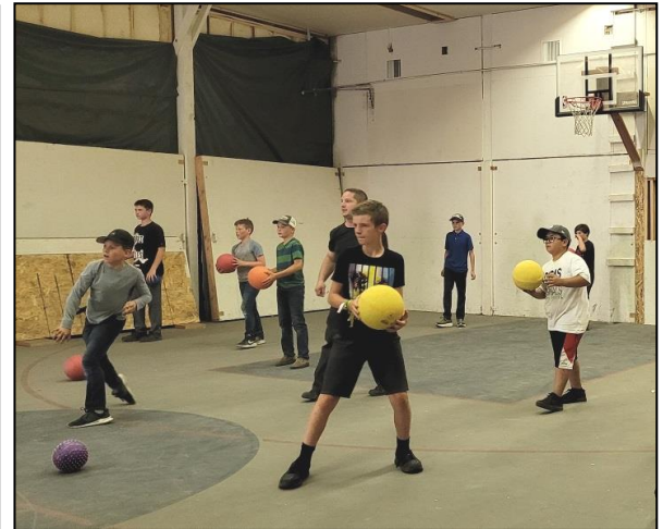
Boys get into a game of dodgeball in the gym building.