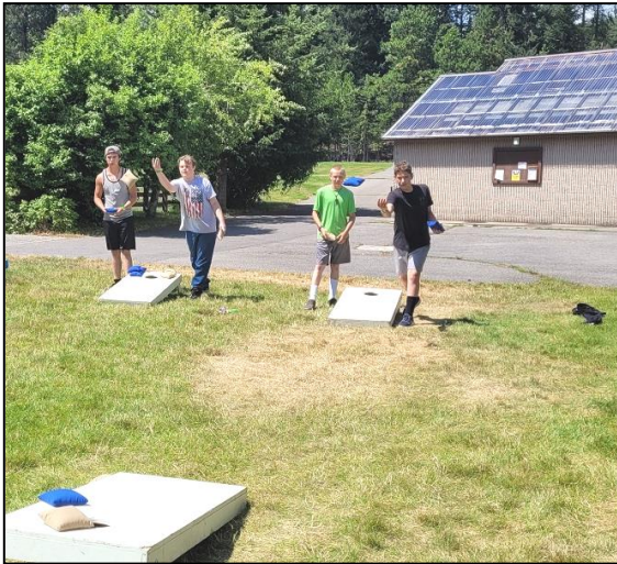
Playing "corn hole" at the park.