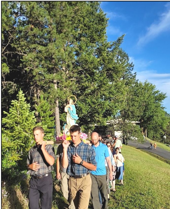
A group of the faithful assembled at the City of Mary on July 13 to recite the 15 decades of the Rosary.