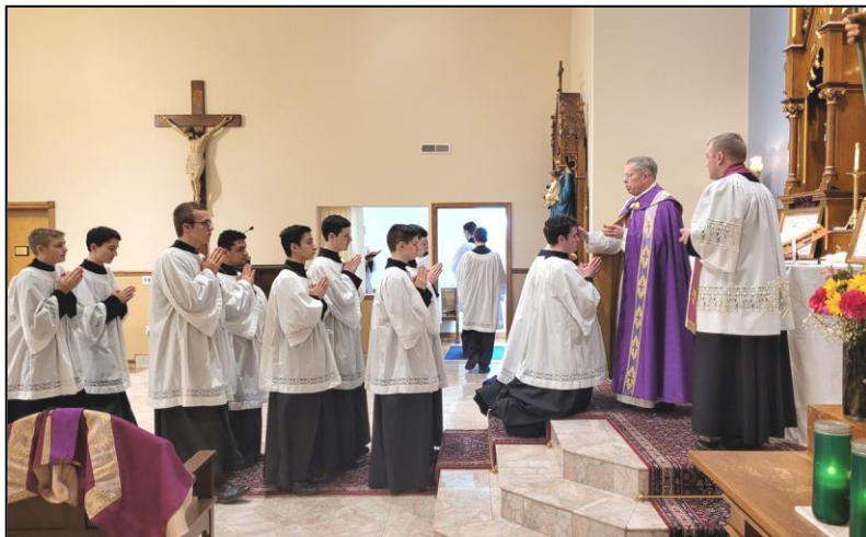
The seminarians received their ashes at the altar during the Ash Wednesday ceremonies.

W e have all heard about the apparitions of Our Lady of Guadalupe, but have you ever stopped to think why Our Lady picked Juan Diego? If you think about it, Juan Diego was a recent convert, who was an Aztec Indian from a pagan