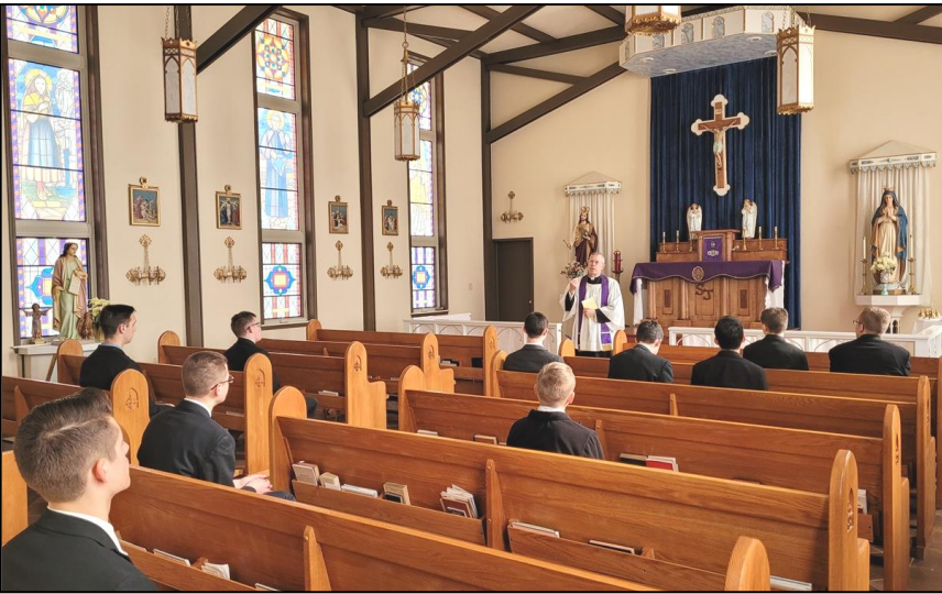
The annual Lenten retreat was held this year on the last weekend of February.