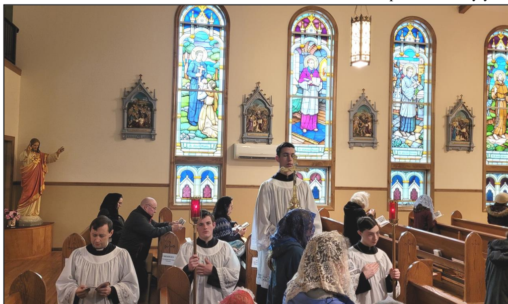
The seminarians join in on Stations of the Cross every Friday of Lent.