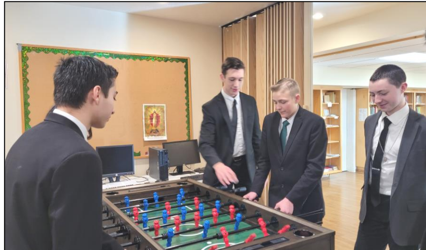
Several seminarians take a break during their annual achievement testing.