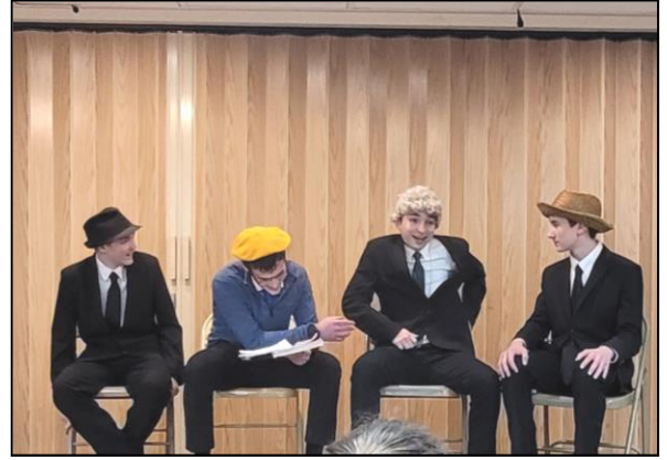
A group of seminarians acted out a skit called "Phobia Workshop" during the parish Talent Show.