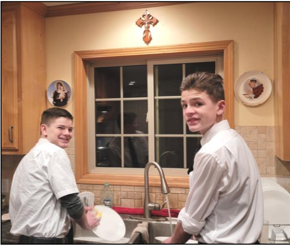
Two brothers take their turn at doing the dishes.