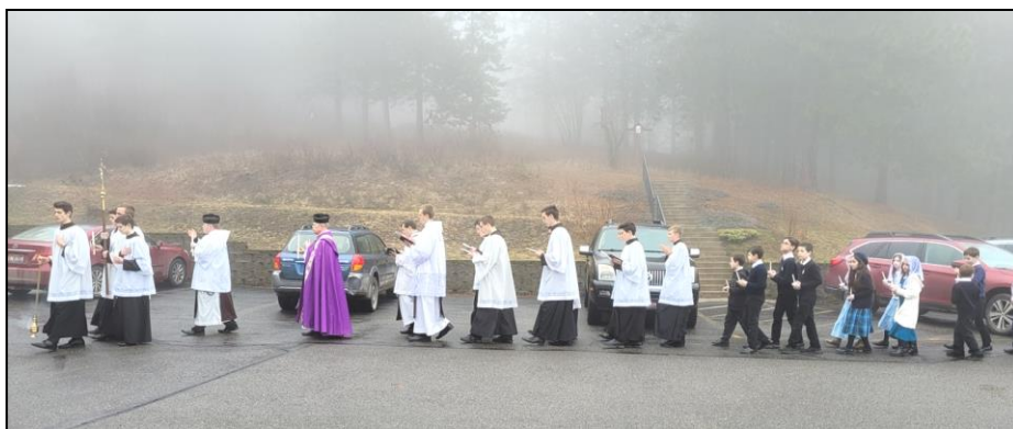
The seminarians sang the melismatic chants during our procession on Candlemas Day.

Contemplate the Blessed Virgin as she gently sings a lullaby to the God-man, in the poverty of the crib of Nazareth.