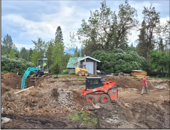
Work continues on the planned new convent, which will allow for expansion of our seminary.