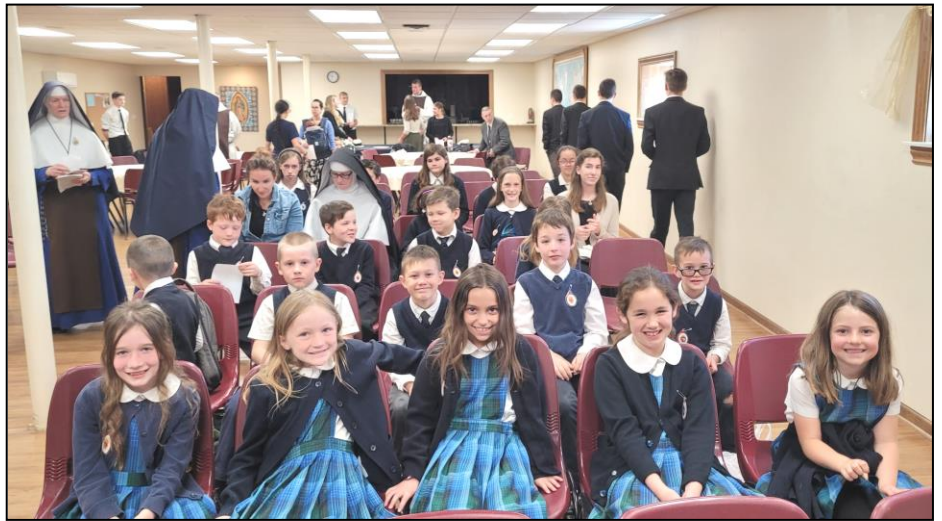
The school children prepare for the school program on the last day of school.

The Guardian is published monthly for the enjoyment of our benefactors and for the family members of our seminarians. This Newsletter is free upon request.