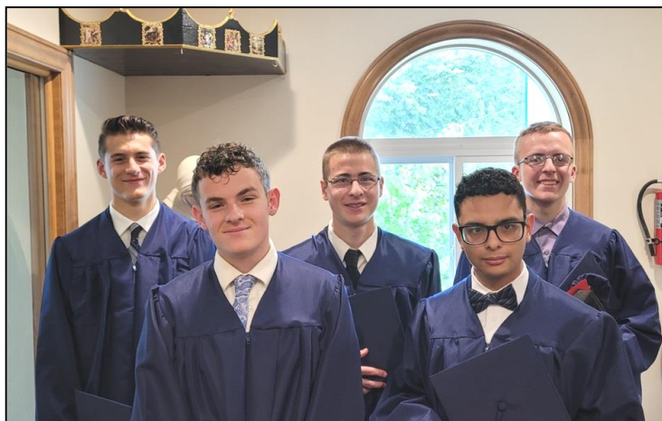
This year's class of five seniors was the largest graduating class we have ever had.