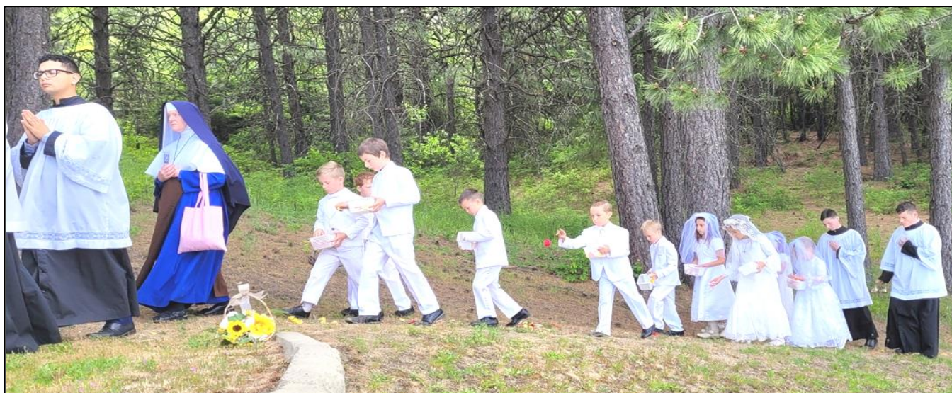
Children dressed in white strew flower petals on the path during the Corpus Christi procession.