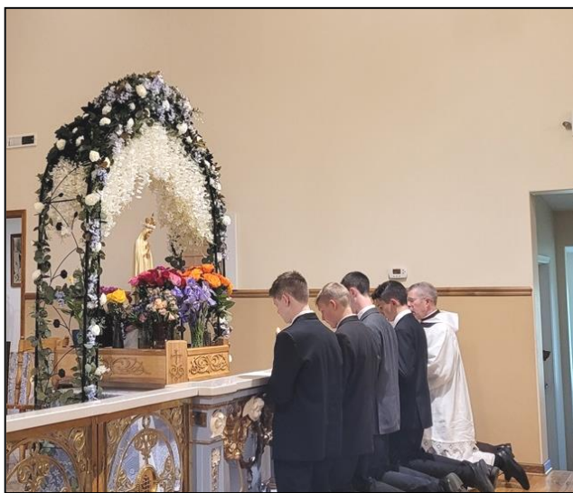
On the feast of the Queenship four of our seminarians made the act of Total Consecration to Jesus through Mary.

Especially now, this being summer vacation, praying the Little Office is a great way to keep an organized prayer schedule and helps to give the spiritual strength we need to carry out our daily duties. In our struggles and constantly throughout the day, let us fly to the protection of Our Heavenly Mother, so that by her loving care and guidance, She may lead us to our heavenly home.