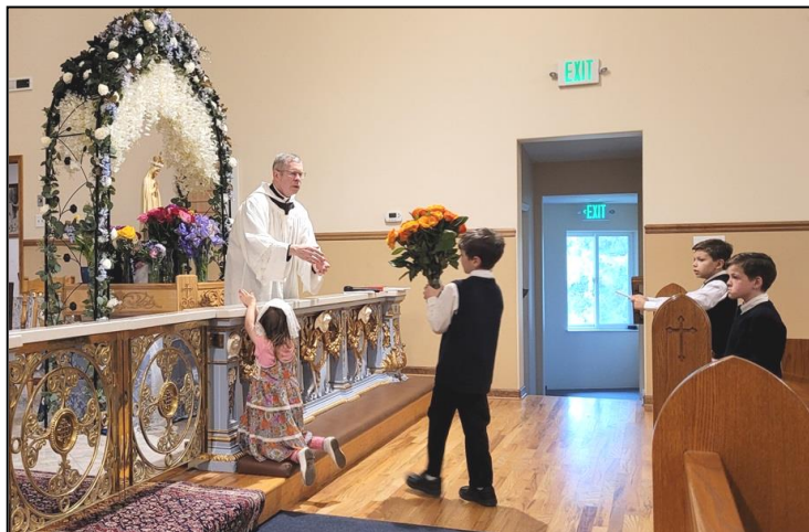
During the month of May the school children took turns bringing flowers to Our Lady's shrine.