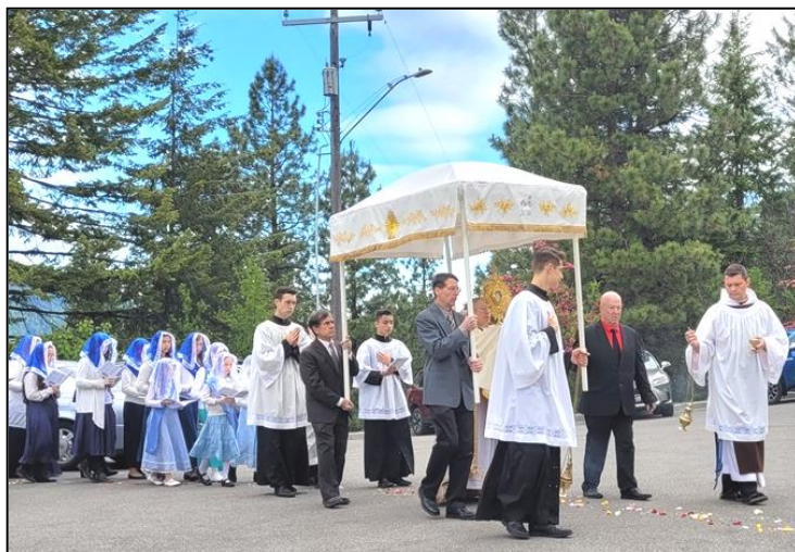
The annual Corpus Christi procession is a highlight in the liturgical year.