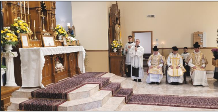
The Credo is sung during the Feast of the Queenship.