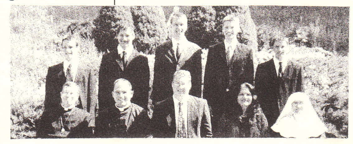
St. Joseph Seminary students and faculty, 2003-4.