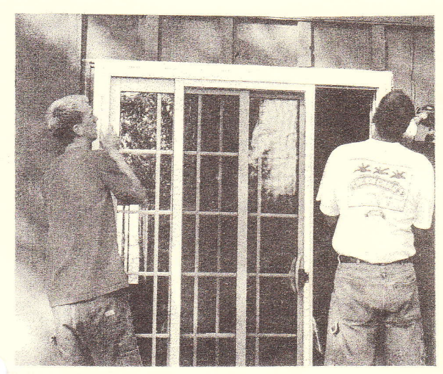
Our new patio door is a great improvement to our seminary.