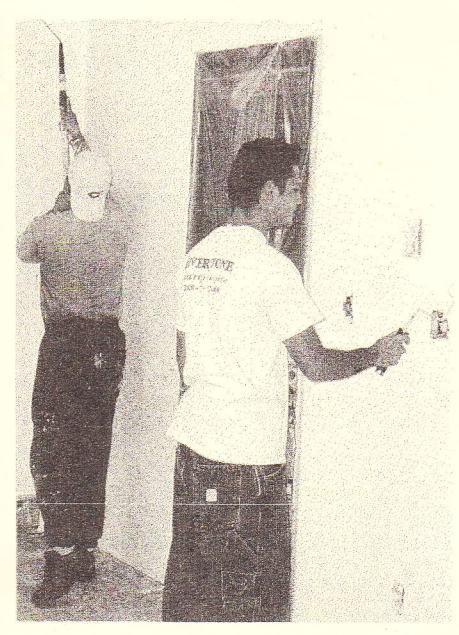
Seminarians help with painting in the convent.