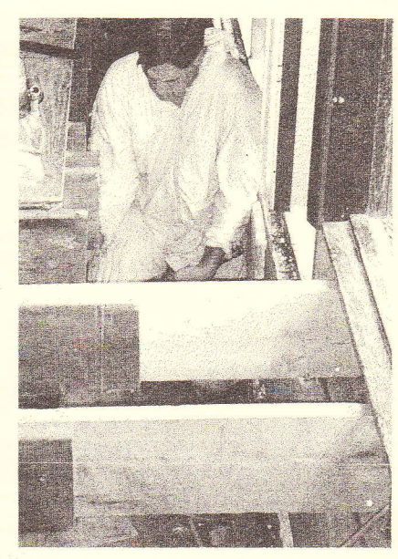
Work continues on the replacement of floor joists under the seminary chapel.