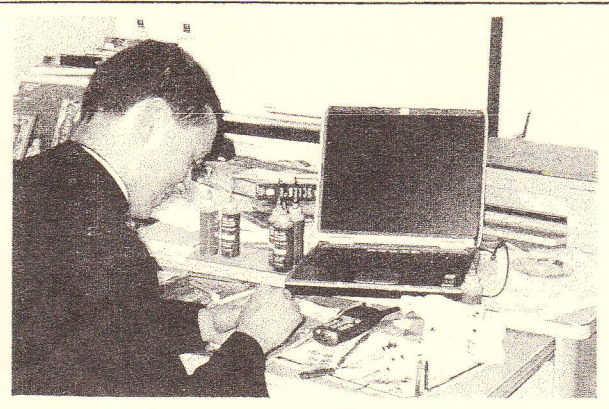
Somehow, by the time school starts, the teachers will bring order out of the chaos on their desks!