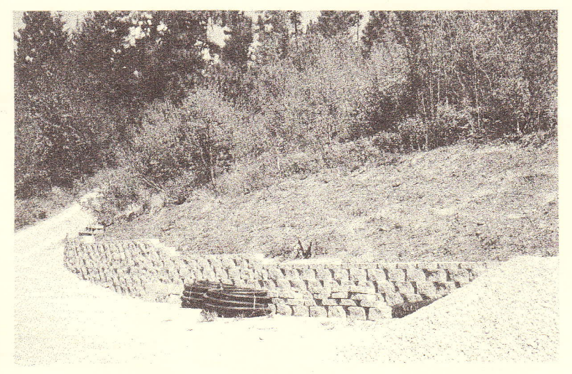
A new retaining wall by the church is another summer project nearing completion.