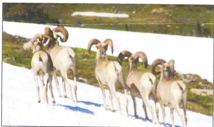
Wildlife abounds in the Park.