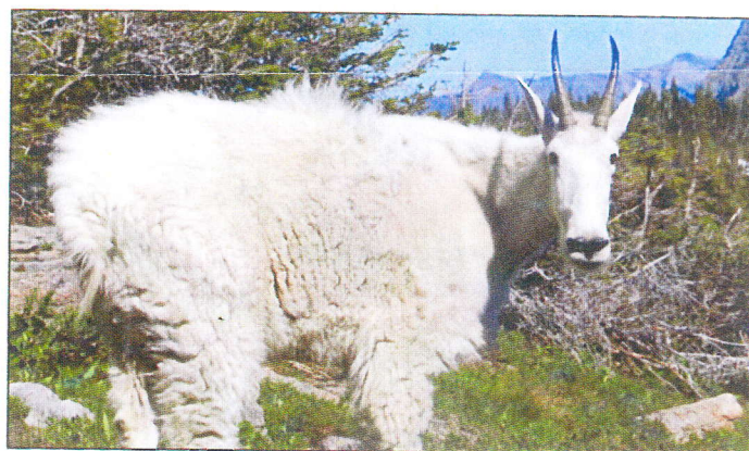
You lookin' at me?