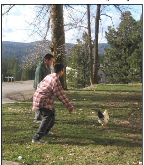
, . . but first we have to catch him . . .