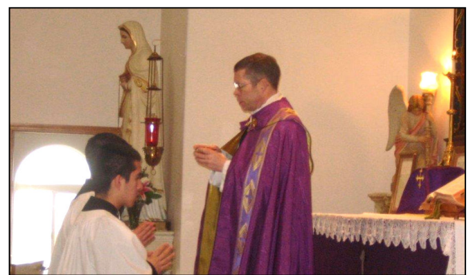
Father prepares to distribute ashes on Ash Wednesday.