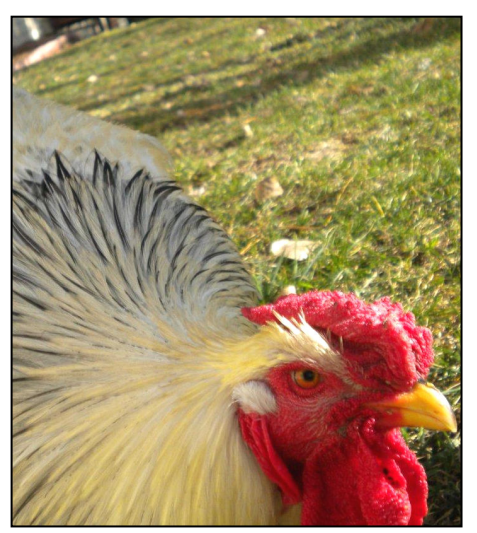
Although this rooster does not know it, we have plans for him . . .