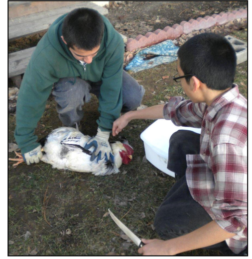
... in order to complete the deed.