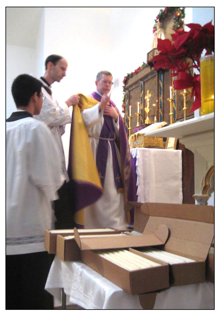
The ceremony of the blessing of candles was held on Candlemas Day.

If you are a young man of high school age who has a vocation, then St. Joseph Seminary may be the place for you. Our four year course of studies offers the regular high school curriculum, with an emphasis on Latin, theology, choir and foreign language. A wellrounded program of daily Mass, prayer and sports complements our academic schedule. For more information, write to the rector of St. Joseph Seminary at the address below.