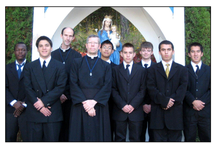
This year there are seven seminarians along with the two priests.