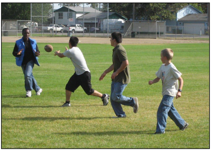
We have been doing ball handling drills, among other things.