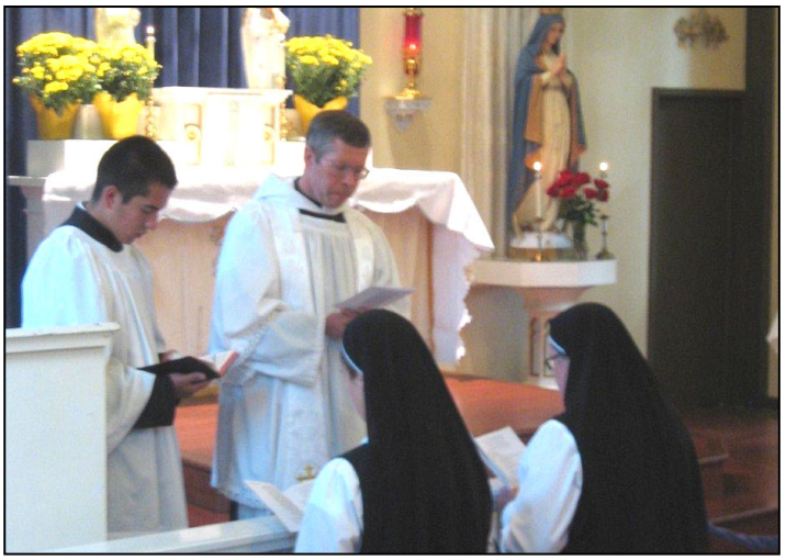
Two new postulants were received into our Sisters' congregation on the Feast of Our Lady's Nativity.