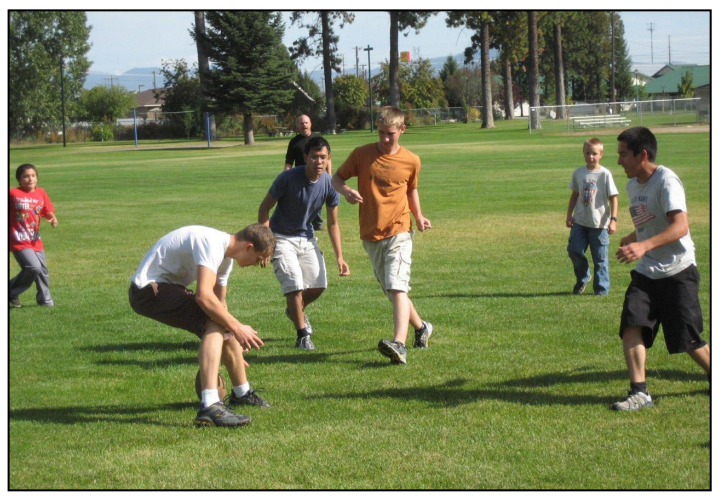
Our football practices have been a learning experience — we have a ways to go!