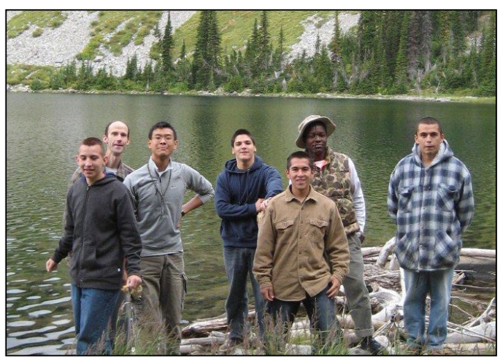
The scenery on Thompson Pass was well worth the climb to get there.