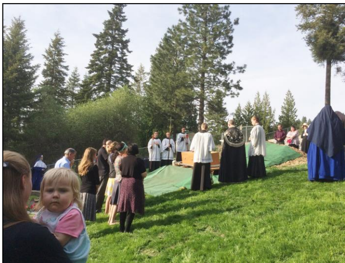
One of our faithful parishioners is laid to rest in our cemetery.