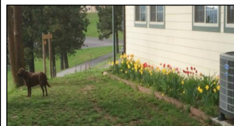
Victor keeps guard over his domain, with spring flowers in full bloom outside the seminary classroom.