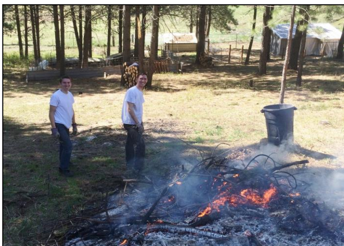
Burning slash piles is just one of many spring chores at the seminary