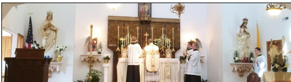
High Mass for the opening of the Forty Hours several weeks ago.