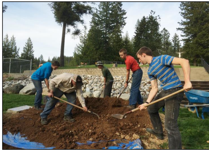
Seminarians help to fill in the grave after a burial in our cemetery.