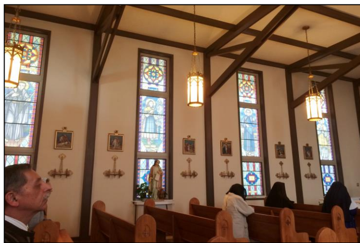
The new stained glass windows add splendid color to our chapel.