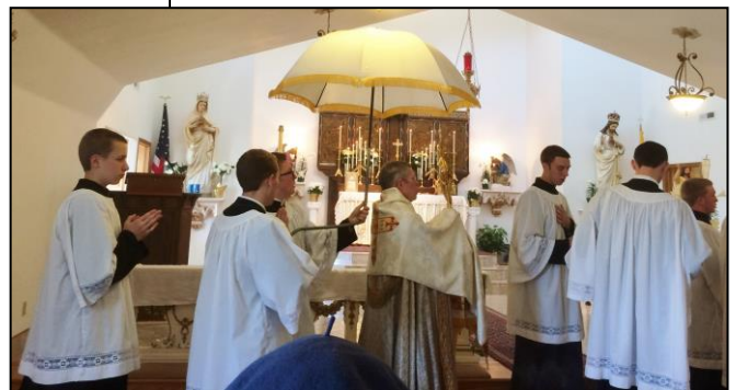
The Blessed Sacrament is carried through the church during opening ceremonies of the Forty Hours.