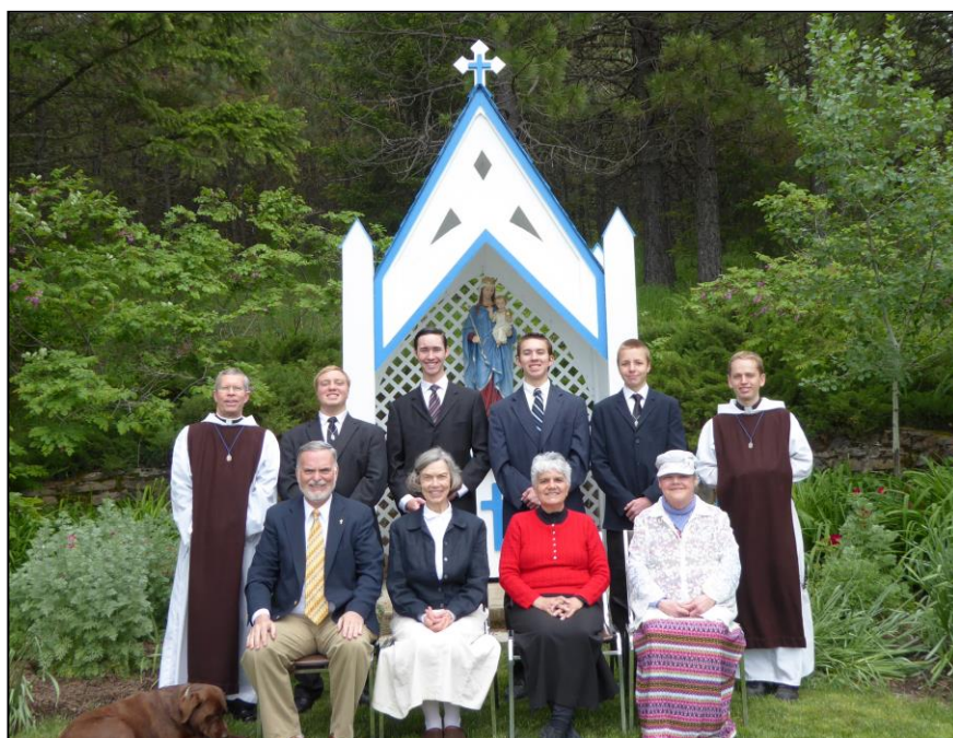
The staff and seminarians pose for a group photo at the end of the year.