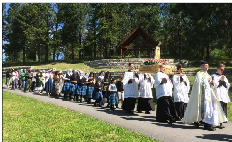
The seminarians carried the statue of Our Lady of Fatima during our May 13 th Rosary procession.