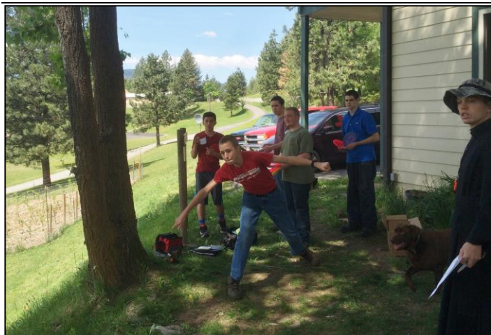
The seminary disc golf course starts by the seminary and winds through the woods.