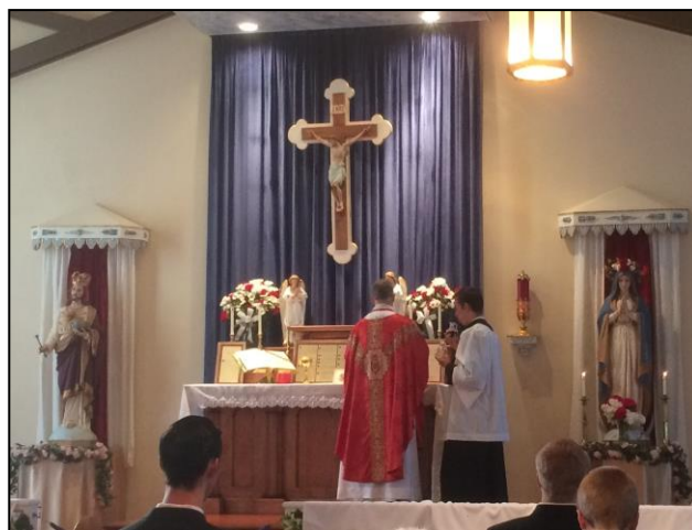
Every day at the seminary begins with the Holy Sacrifice of the Mass.