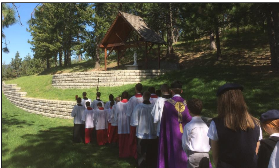
The Rogation procession proceeds along the path in front of our Sacred Heart shrine.