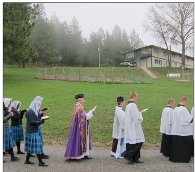
The procession goes around the seminary as we chant the Litanies.