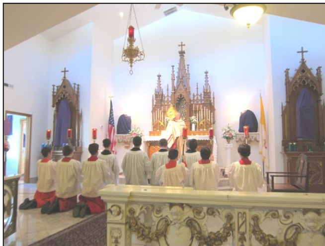
Closing ceremonies for the Forty Hours Adoration took place on Passion Sunday

For me, road trips are kind of fun so I enjoyed the 6-7 hour drive to our destination. Of course it was a little tiring sitting for that long of a time, but when sleeping, it was really nice. On the way, the view of the Rocky Mountains was gorgeous. It was a sunny day and, being spring, the mountainsides were covered in green. At one point of the journey, we passed a part of the mountains were Our Lady of the Rockies is. That statue is 90 feet in height and is very beautiful.