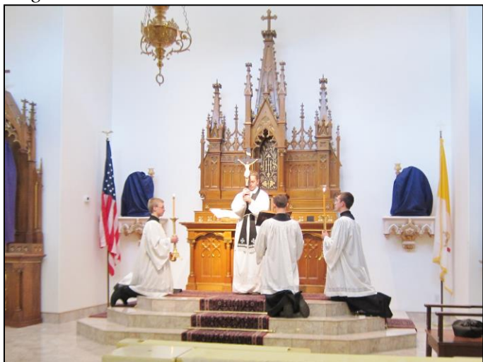
Ecce Lignum Crucis – Behold the Wood of the Cross!