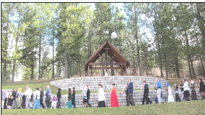
The weather was chilly but sunny for the procession on Palm Sunday.

The act of crowning Mary's statue can be dated back to the earliest days of the Church. The practice became popular in the 19 th century, by means of which people could express their love and devotion. By