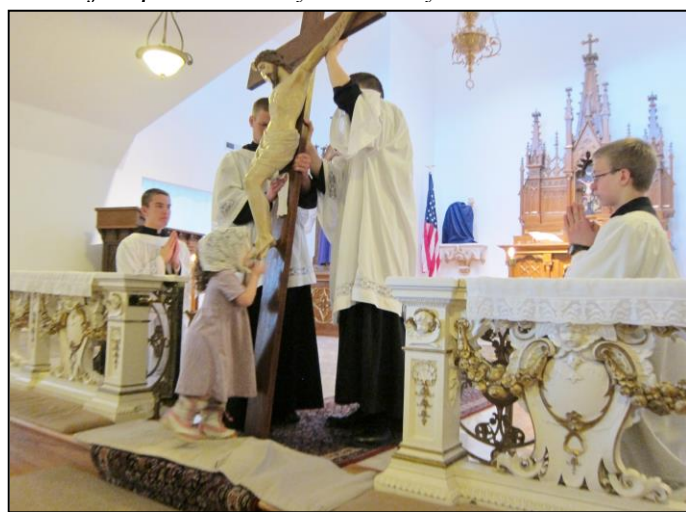
Seminarians hold the large cross on Good Friday for the veneration of the faithful.