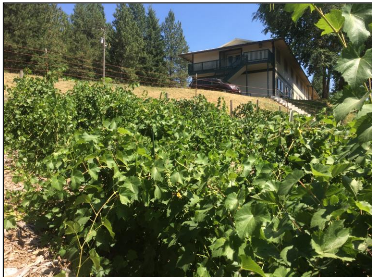
Our seminary vineyard was planted just 2 years ago but is now burgeoning with grapes.