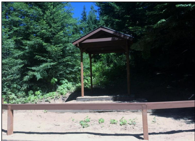
This outdoor shelter was built at the Boys' Camp for the celebration of Holy Mass.