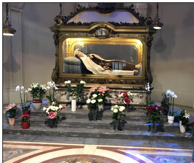
The majority of the relics of Saint Therese the Little Flower are contained in this reliquary at the Carmel in Lisieux, France.