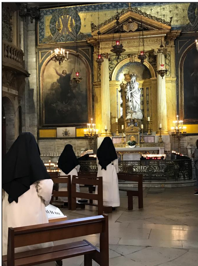
One still witnesses piety and traditional religious habits at the shrine of Our Lady of Victories in Paris.