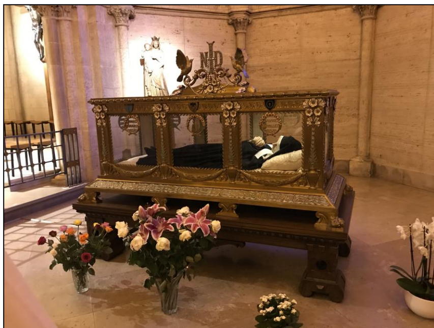
The incorrupt body of Saint Bernadette reposes peacefully in Nevers, France.