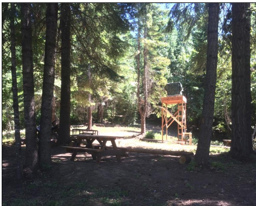
Many hours of labor have been expended in preparing the site for the Boys' Camp.