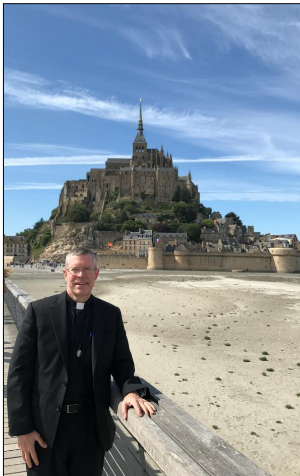
Mont Saint Michel in Normandy was built to honor Saint Michael the Archangel.