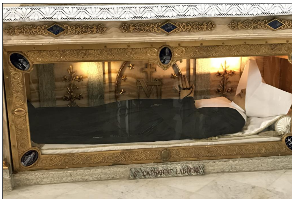
The incorrupt body of Saint Catherine Laboure rests in the chapel where Our Lady revealed to her the design for the Miraculous Medal.