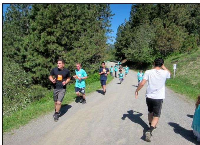
Our annual jog-a-thon is a fundraiser for the support of our parish school.