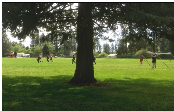
Our seminarians and young men enjoy a game of soccer at the park.