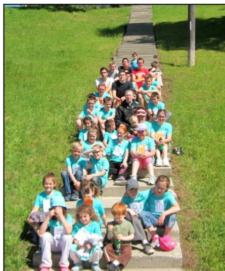
After the jog-a-thon the students and seminarians take a break for a group photo.