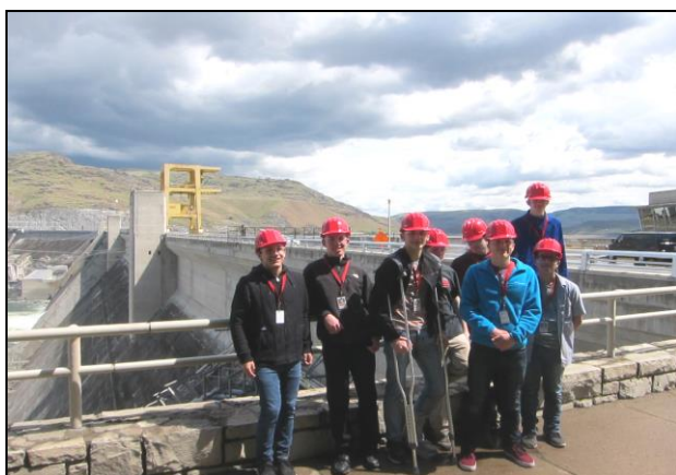
The High School boys joined the seminarians for a field trip to Grand Coulee Dam.