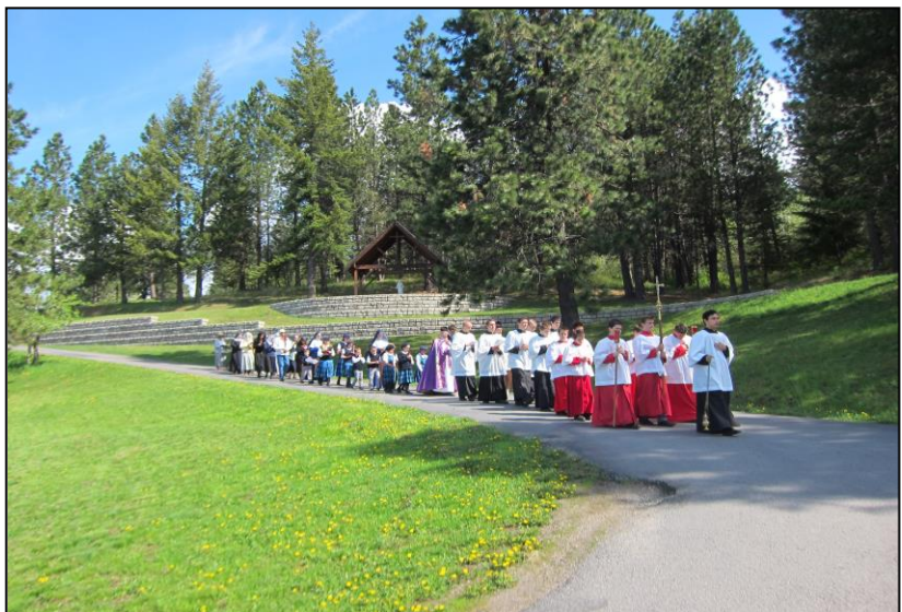
The seminarians and students chanted the litanies during the Rogation procession.

remember to live, that we may one day see each other in the eternal happiness of Heaven.