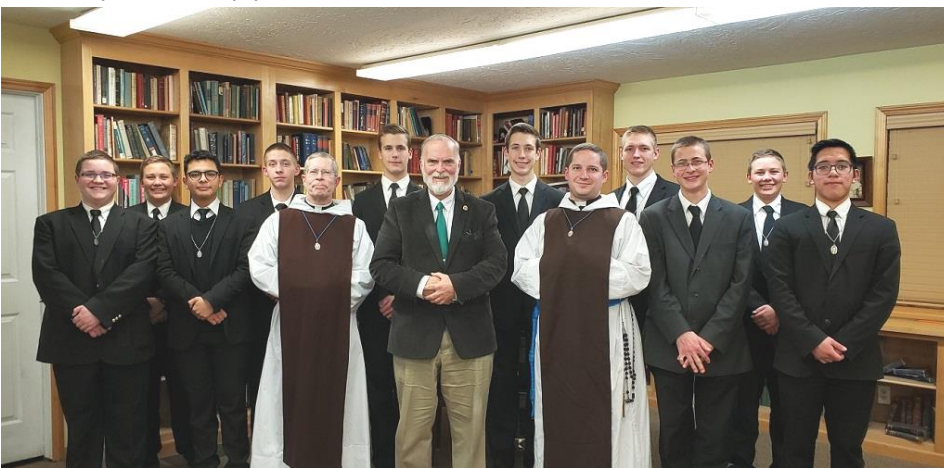
In December the seminarians and staff gathered for a group "Christmas" photo.

The image of Our Lady on the tunic is so full of detail that you