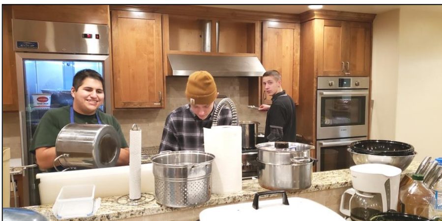
On the Saturday before Gaudete Sunday the seniors worked on preparing the food for the festival in honor of Our Lady of Guadalupe.