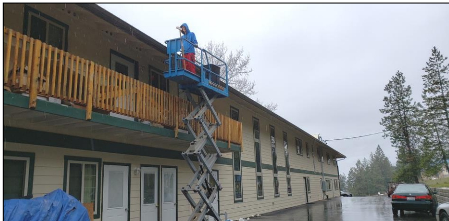
Recent Saturday chores included cleaning the gutters at the seminary.