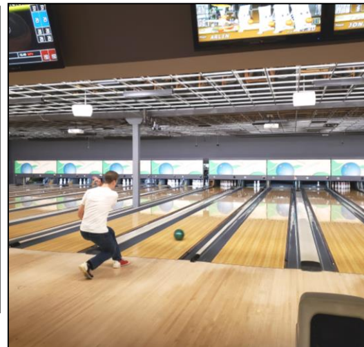
Bowling on the feast of the Immaculate Conception has become a tradition at the minor seminary.