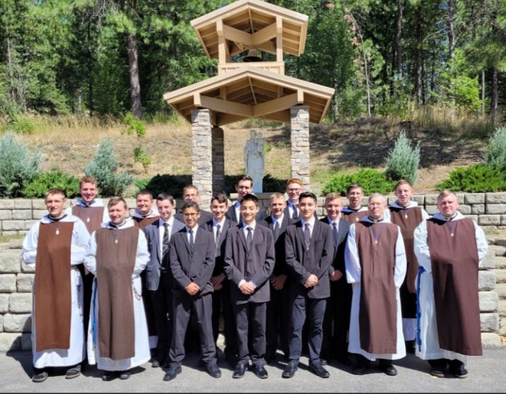
Our seminary this year comprises 3 Priests and 5 Brothers, along with the seminarians.

minor seminarians and we have the opportunity to receive Holy Communion every day of the week. As I like books, the seminary library is truly special. It has so many great tiles that wait to be read, that it is a sorrow to be separated from them.