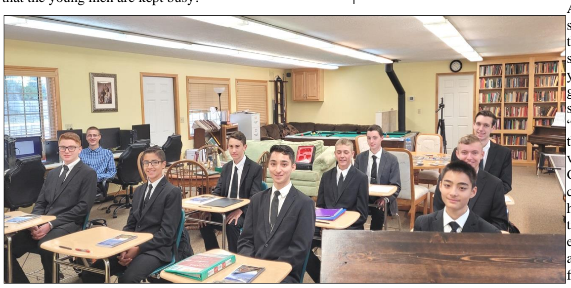
Seminarians are in their desks for the first day of classes.