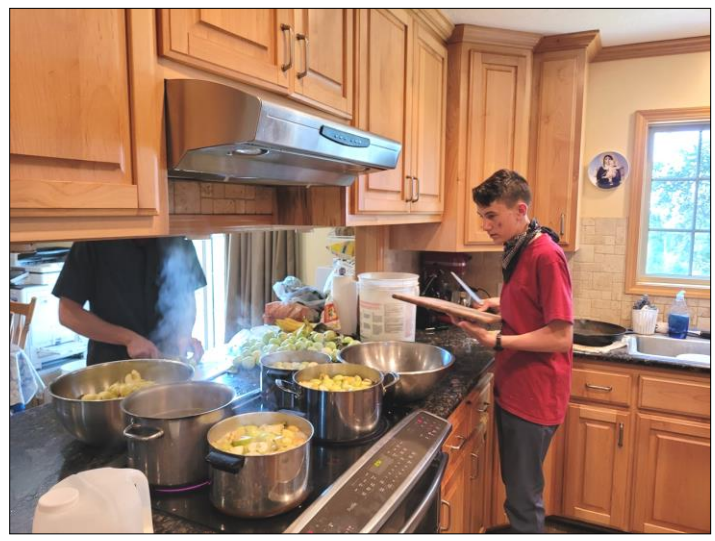
The abundant fruit from our summer apple tree is made into apple sauce.