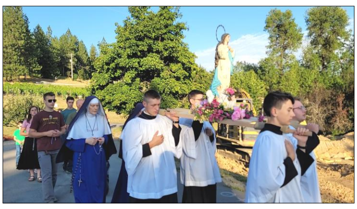
During the summer we have a monthly Rosary procession, reciting the 15 decades.