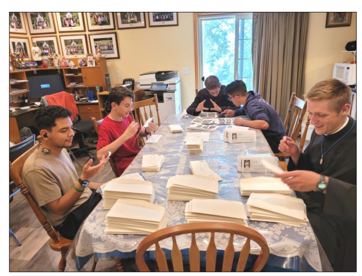
Processing the monthly mailing of the Guardian requires a group effort.